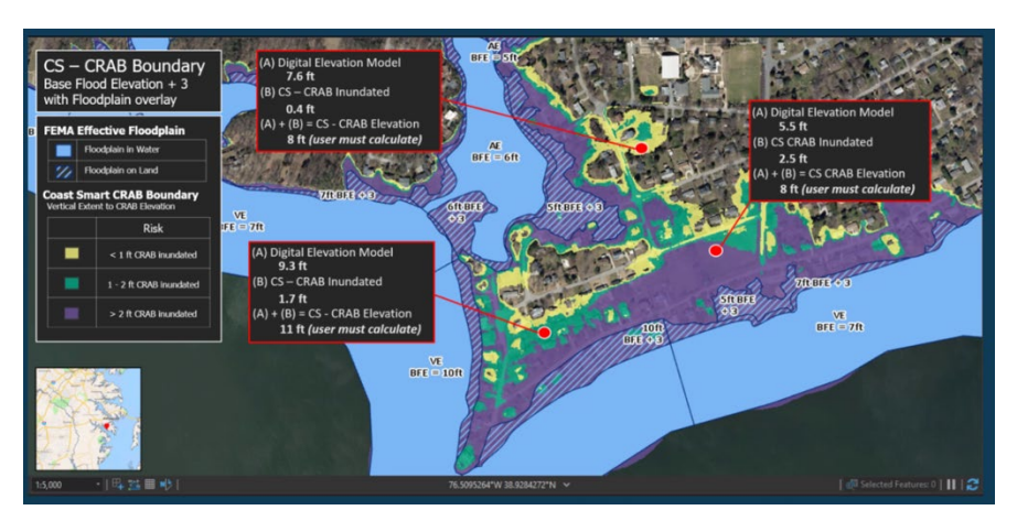
MDE and FEMA Story Map

The CTP network works to continually advance the mission of building a more resilient nation.