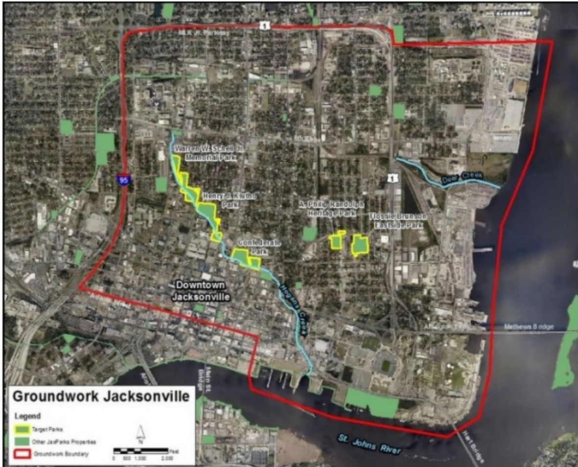
Figure 5: Project area of GroundWork Jacksonville, showing target areas in yellow. Source

City of Jacksonville (Duval County), FL (Population 911,507): In 2013, the City of Jacksonville executed a memorandum of agreement with non-profit provider GroundWork Jacksonville to help galvanize the community toward completion of two large scale (Est. $100M each) flood mitigation projects that will alleviate economic losses for residents and business owners who live, work and play near the St. Johns River, which meanders through the downtown of the consolidated city and county. The flood mitigation projects will occur at Hogan’s Creek and McCoy’s Creek which stem from the St. John’s River. Historically, these creeks flood during afternoon showers, but the flooding became worse after a recent string of hurricanes in Florida.