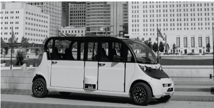
Figure 3. A SMRT self-driving mini-bus in Columbus, Ohio.