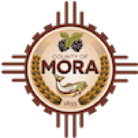
Figure 2. Mora County, NM emblem. Source

Mora County, NM (Population 4,521): Located in a rural area of New Mexico, with more than 80% of residents considered low-income, Mora County was economically depressed prior to 2005. With the help of local businesses, county officials, and a local nonprofit the community has been able to create more than a dozen cooperatives. Cooperatives are a model which provides seed grant funding to organizations to provide technical assistance, workforce development training, business assistance, pooled resources/fund development, and the creation of cooperative