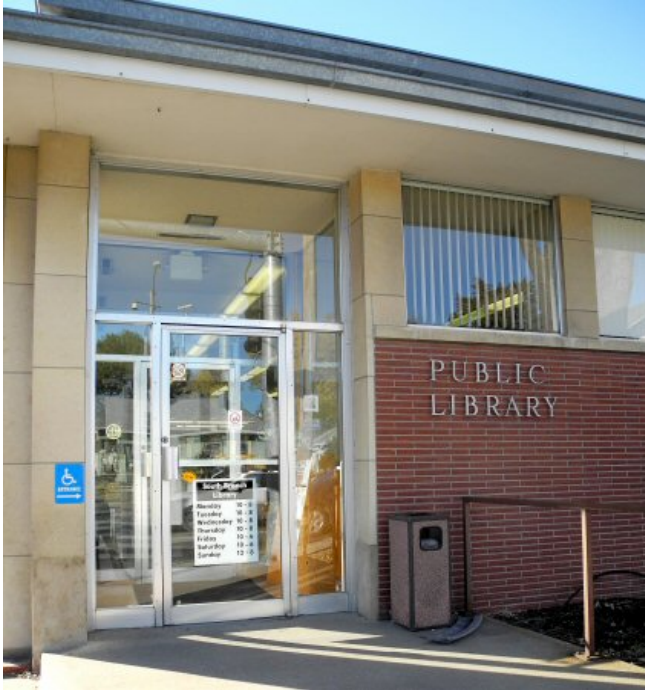
Figure 4. The entrance to the South Branch of the Nebraska Public Library system, which has benefitted from the fiber optic construction.