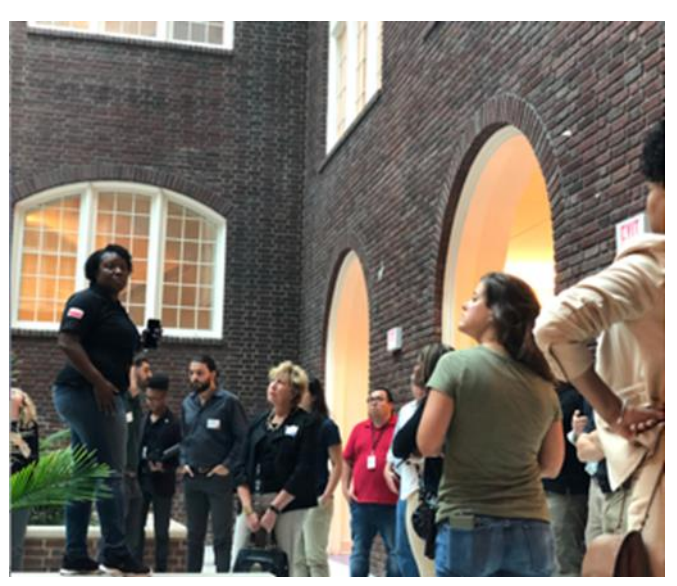
Figure 1 FEMA Region III: Risk Reduction Consultation in Washington, D.C.

The mobile workshop provided tangible examples of the types of flood risk mitigation projects discussed during the sit-down meeting and grounded that discussion in a real-world context, providing a glimpse into the value of interactive meeting design. FEMA Region III is actively looking for opportunities to introduce similar mobile workshop components into meetings with State and local partners.