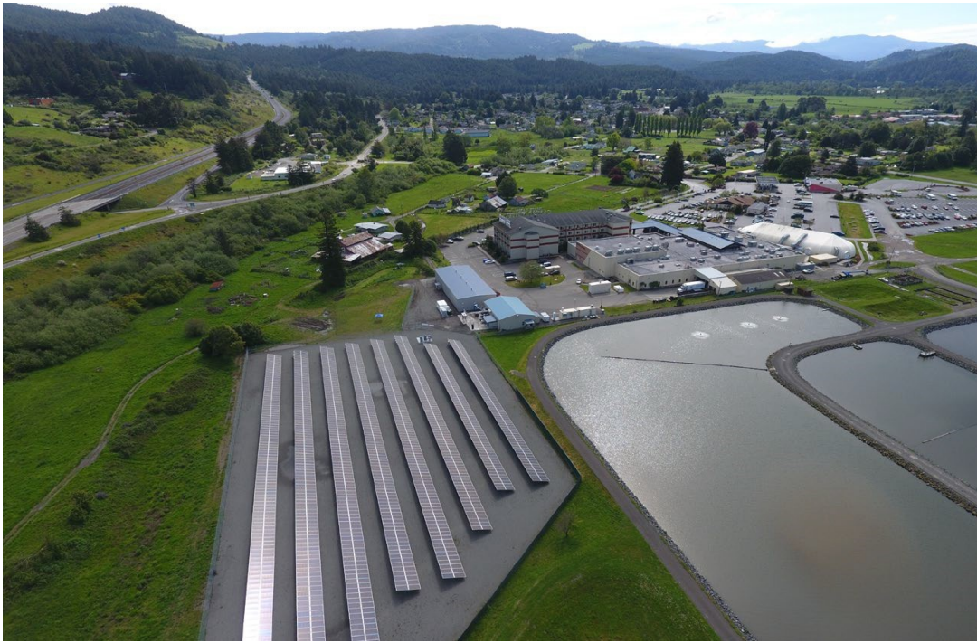
Blue Lake Rancheria Tribe Microgrid Project in Humboldt Bay, CA