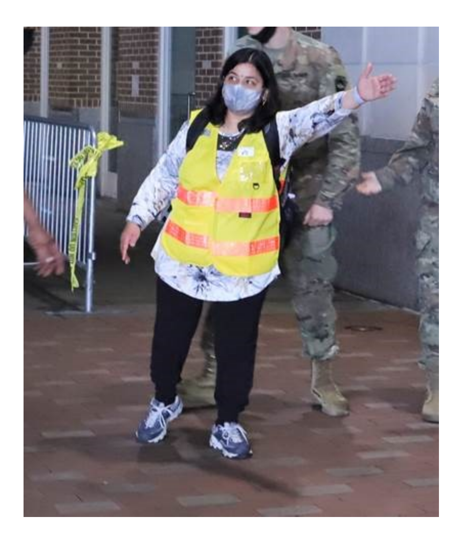
Caption: A Sewa volunteer manages traffic control at the state-run, federally-supported Center City Community Vaccination Center in the Pennsylvania Convention Center in Philadelphia.