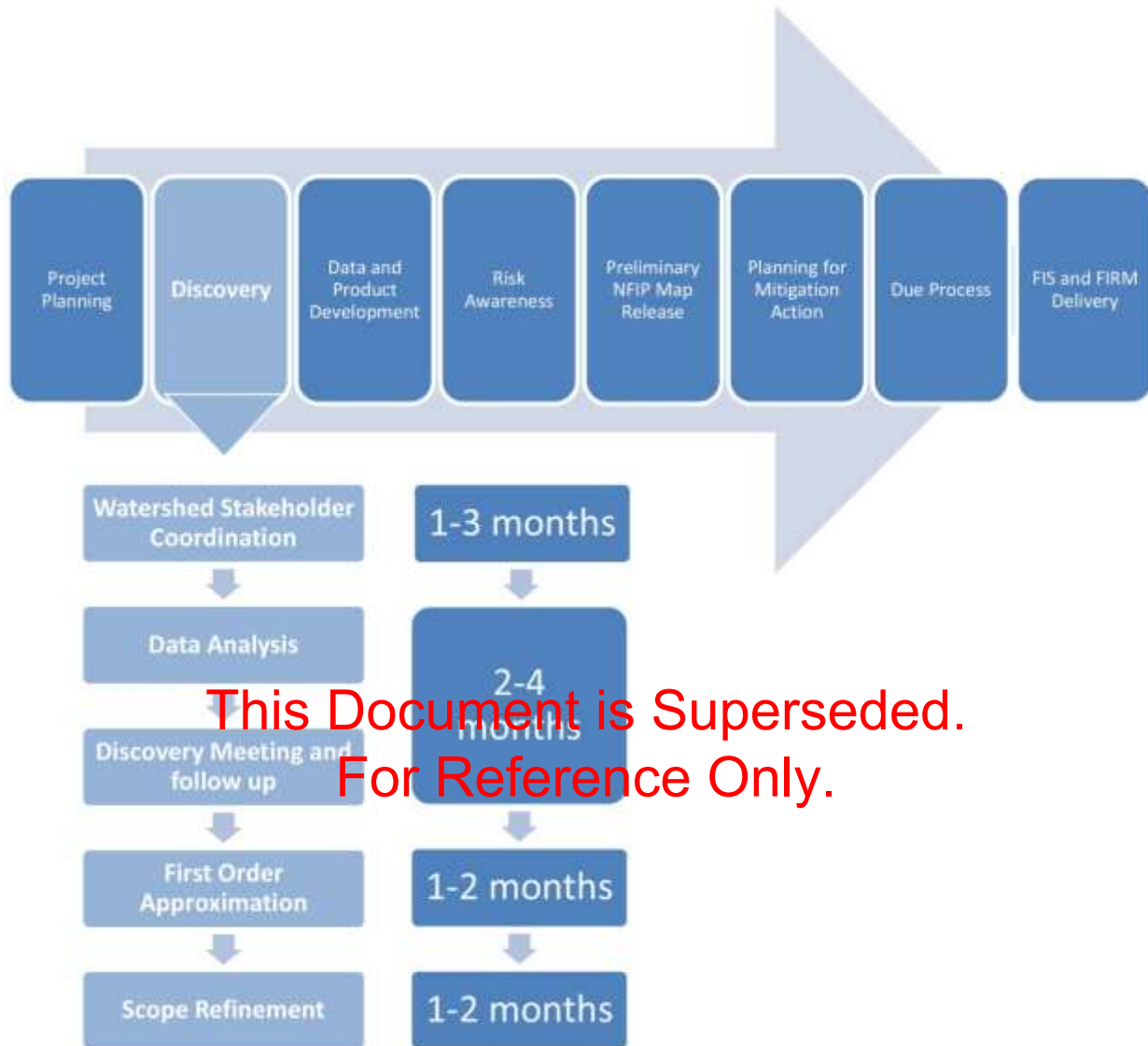
Figure 1. Discovery Process Steps.