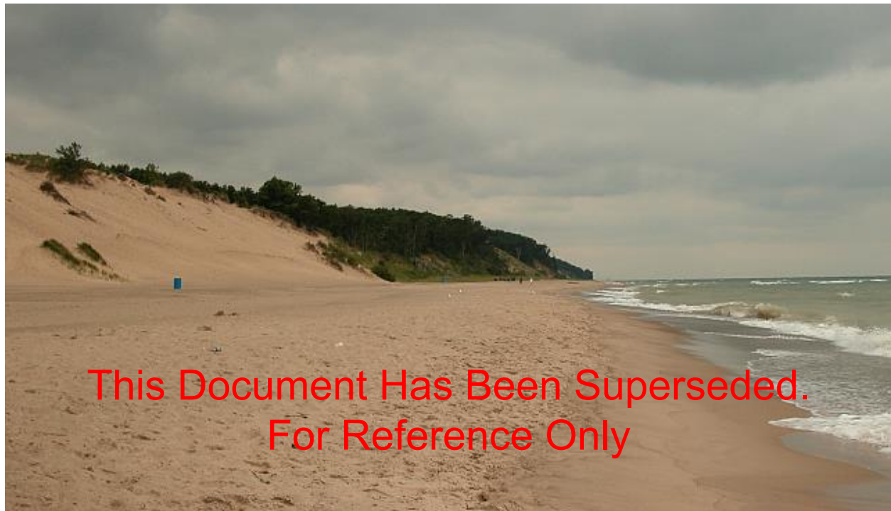
Figure 3: Sample of a Large Relic Dune, Mount Baldy, Indian Dunes National Lakeshore, Lake Michigan

Debris from human sources may originate from flood damage. This debris may include broken pieces of shore revetment cast inland by extreme surge and wave attack, or floatable materials, such as construction materials, building materials, and home furnishings.