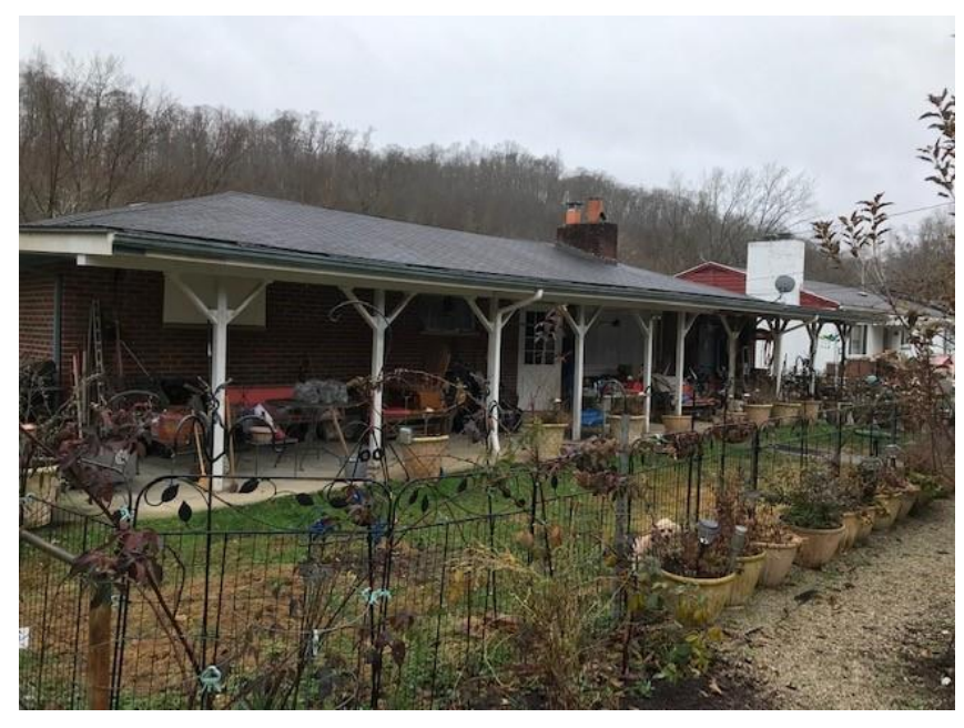
The façade is not visible in the left photograph due to distance, tree coverage and automobiles. Thus, taking the photograph from another angle (right photograph) was necessary.