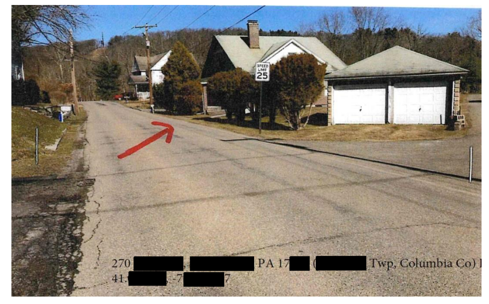
Scans with pen markings and text.