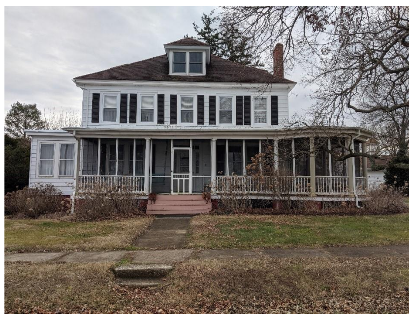
Tree coverage in the left photograph made it difficult to discern features of this house. Thus, an unobstructed view (right photograph) was necessary.