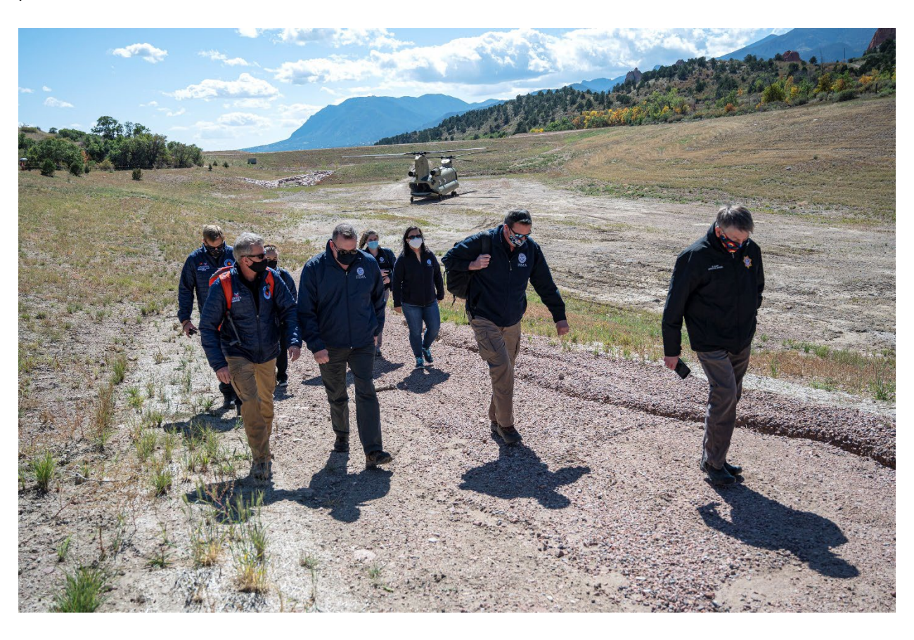
Figure 11: FEMA and Colorado DHSEM leadership survey a detention pond constructed in Colorado Springs to collect floodwaters and debris, protecting downstream properties. The project received $6.5 million in Hazard Mitigation Grant Program funding from FEMA.

FEMA's Hazard Mitigation Grant Program provides financial assistance to the state following a major disaster declaration, with the funding based on total disaster program expenditures. Following the 2013 floods, Colorado received more than $57 million for the program. The state works with communities to develop projects that can mitigate the impacts of future disasters. Projects were funded in communities across the state to deal with a variety of hazards, from flooding to landslides to wildfires. Some grants also provided funds to local communities to update their hazard mitigation plans.