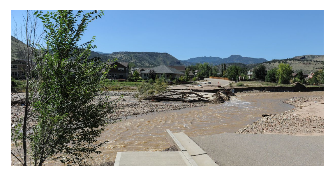
Figure 8: Restoring McConnel Drive was one of the largest Public Assistance projects in Lyons.

Two communities that were especially hard hit by the flooding were Lyons and Jamestown in Boulder County. The flooding washed away roads, bridges, and damaged other critical public infrastructure, leaving the communities isolated and with a lengthy road to recovery. These communities had extensive debris removal efforts and emergency road restoration as well as longer term infrastructure repairs that have lasted years.