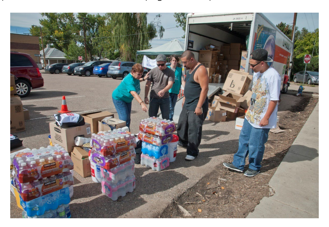
Figure 4: Voluntary agencies provided food and basic supplies to flood-stricken communities.

FEMA's Transitional Sheltering Assistance (TSA) program was activated on September 21. This program allowed individuals and households to stay in hotels as an interim form of housing while looking for rental housing or prior to returning to their damaged homes. The number of households in hotels peaked at 598 on October 17 and the program ended operations on December 15.