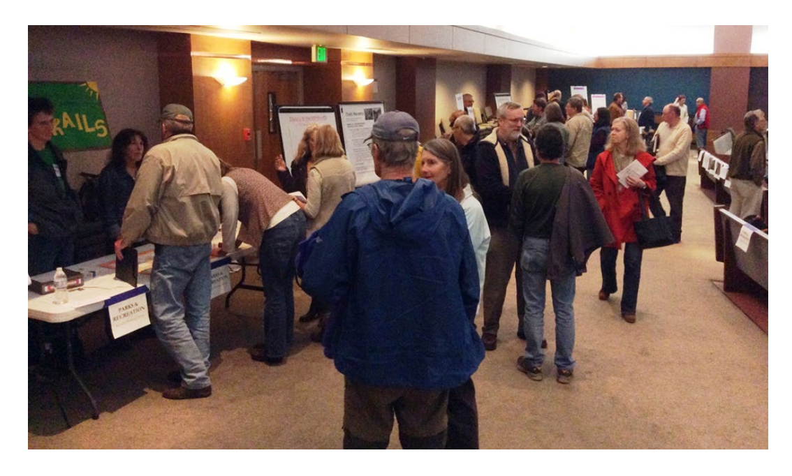
Figure 12: Community meetings allowed Lyons residents an opportunity to voice their priorities for the community's recovery.