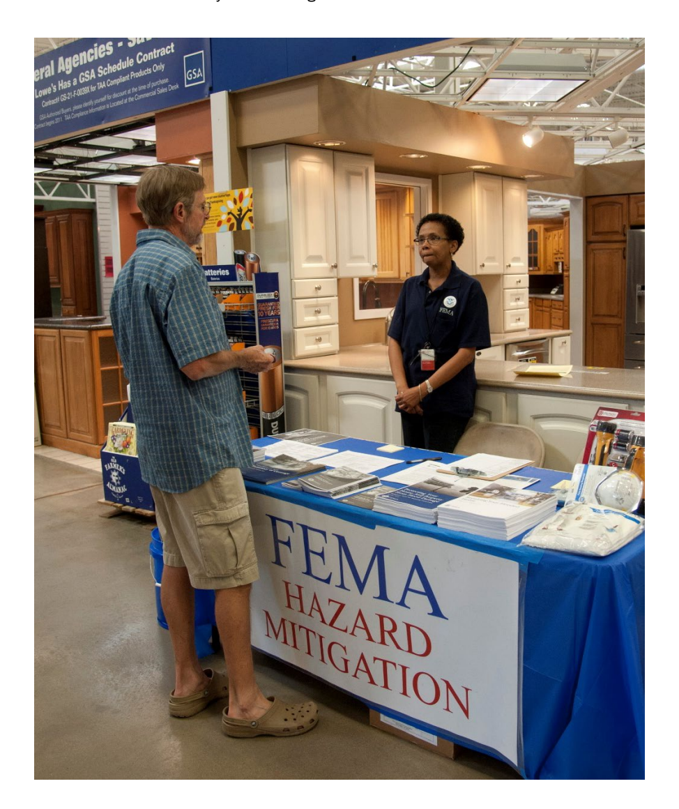
Figure 14: FEMA staff set up in hardware stores and home improvement centers in flooded communities to provide information to more than 4,000 Colorado residents on how to rebuild stronger and safer.