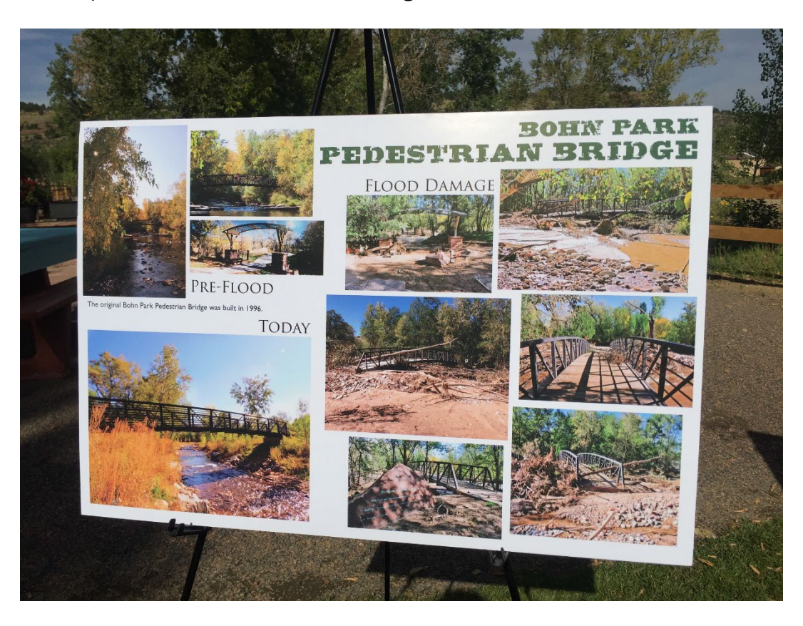
Figure 13: A sign on display at the Lyons Five Year Recovery Celebration, highlighting work done in Bohn Park, which received funding from FEMA.

The floods are a clear example of the concept of whole community recovery. This means the collaboration of all levels of government, in partnership with the private sector and non-profit organizations. Government funding is a critical component to the recovery but marrying those dollars with local resources and a clear vision for the future provides an exponential benefit and greatly expands the capabilities to build back better, stronger, and safer.