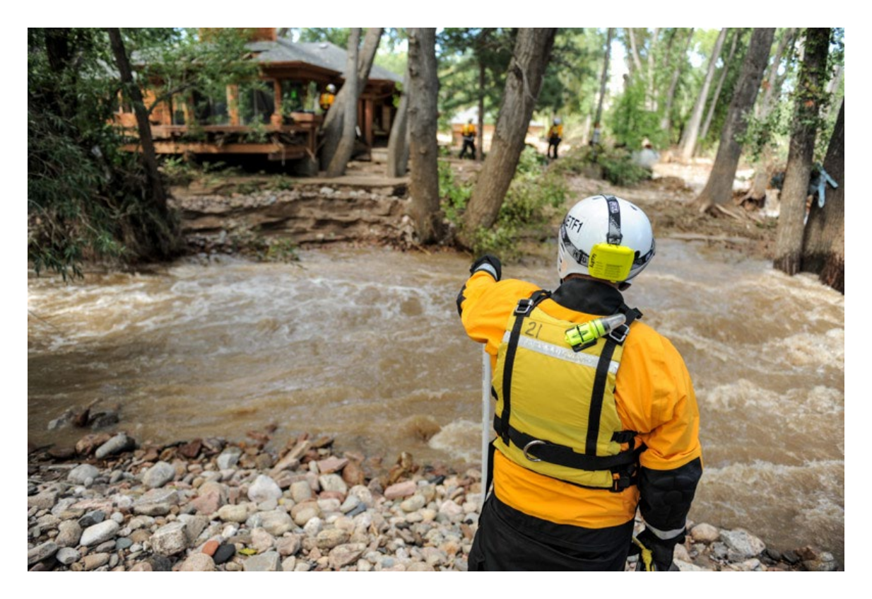
Figure 3: FEMA Urban Search and Rescue Nebraska Task Force 1 was one of five federal teams deployed to support Colorado search and evacuation efforts.