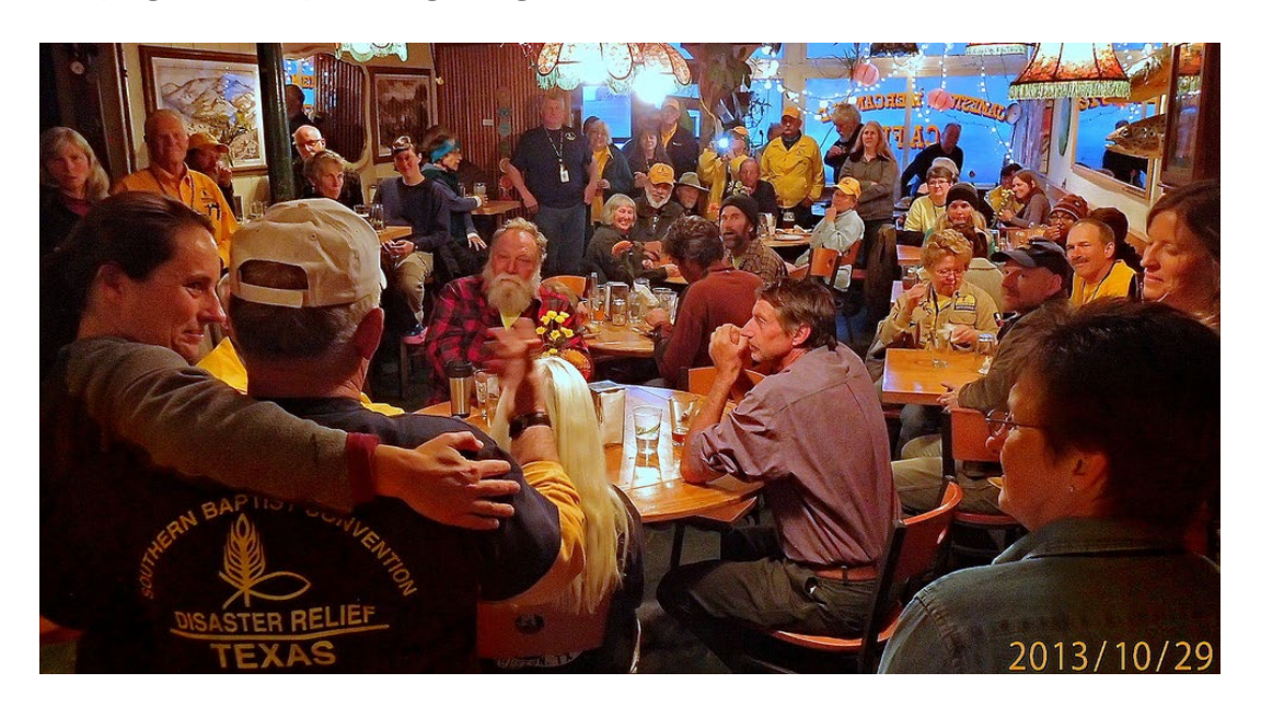
Figure 7: Volunteers from Texas gather for a farewell dinner following their volunteer mission in Jamestown.

The volunteer hours also were of financial benefit to local jurisdictions as they had the potential to be credited toward the jurisdictions' local match for FEMA reimbursement under the Public Assistance program when pertaining to eligible activities.