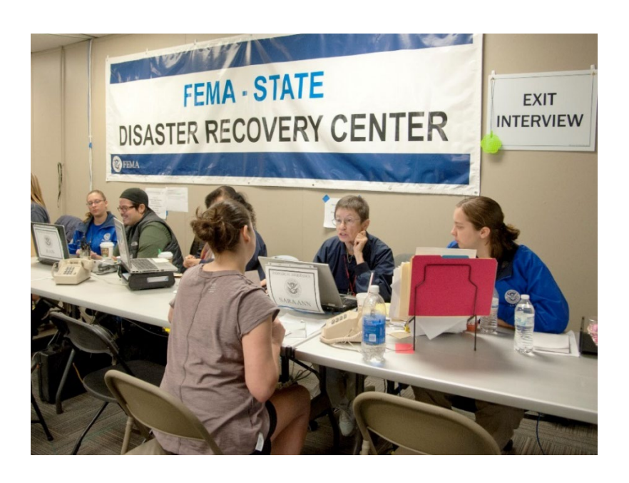
Figure 5: Disaster Recovery Centers provided a location where individuals could meet in person with disaster recovery specialists and discuss their individual situations.