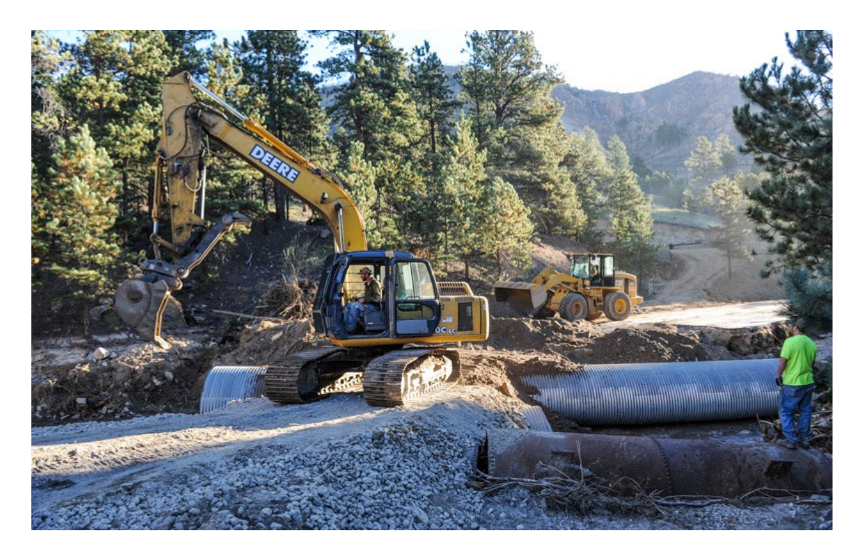
Figure 10: Environmental reviews and securing necessary permits are important requirements for any projects occurring in floodplains or wildlife habitat. Only limited exceptions are made for emergency actions. The Colorado DURT team sought to simply these efforts, facilitating community recovery.