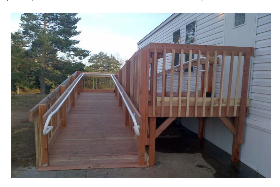
Figure 6: An example of a FEMA manufactured home used in Colorado. This home had a ramp added to make it accessible for a wheelchair user.

To address the severe housing shortage and lack of available rental properties in selected communities, FEMA activated its direct housing program. Under this effort, lots were rented at five manufactured housing communities in Boulder, Larimer and Weld counties. A total of 54 manufactured homes were used to house 47 households. The first home was occupied on November 27, 2013, and the final home was vacated on March 14, 2015.