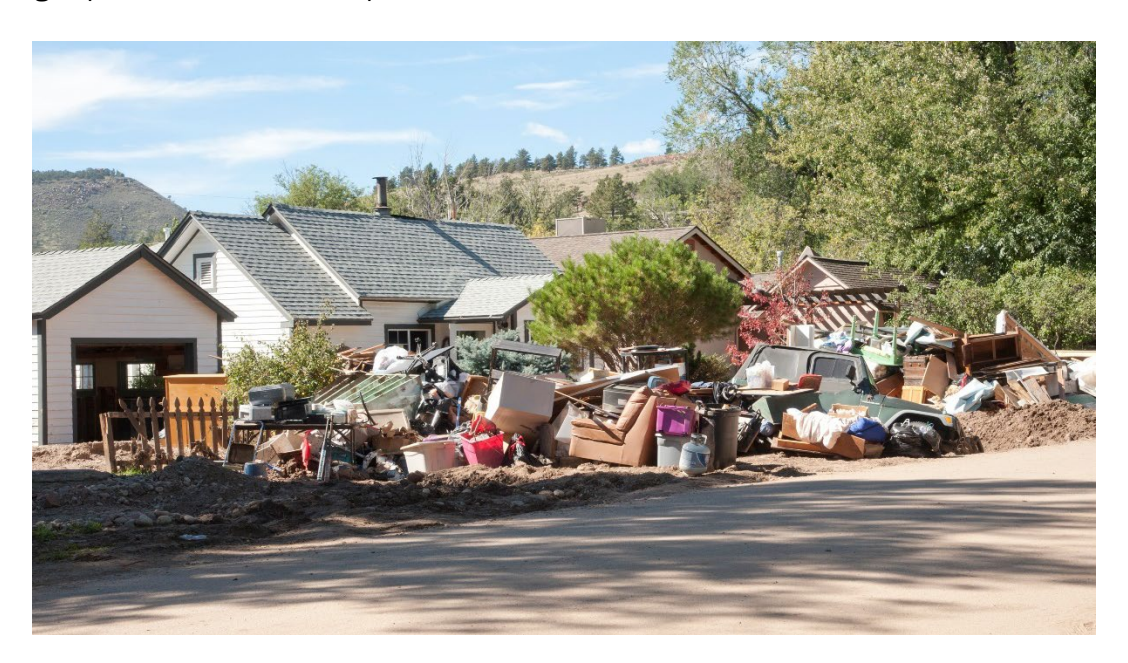
Figure 9: Due to program changes authorized in the Sandy Recovery Improvement Act, Lyons was able to receive additional funding for debris removal efforts.

The Sandy Recovery Improvement Act legislation passed following Hurricane Sandy created several changes to FEMA's Public Assistance program that gave FEMA greater flexibility in implementation and in supporting communities. These changes were collectively referred to as Public Assistance Alternative Procedures (PAAP). The Colorado floods were the first large event in FEMA Region 8 following implementation of these procedures and several communities were the beneficiaries.