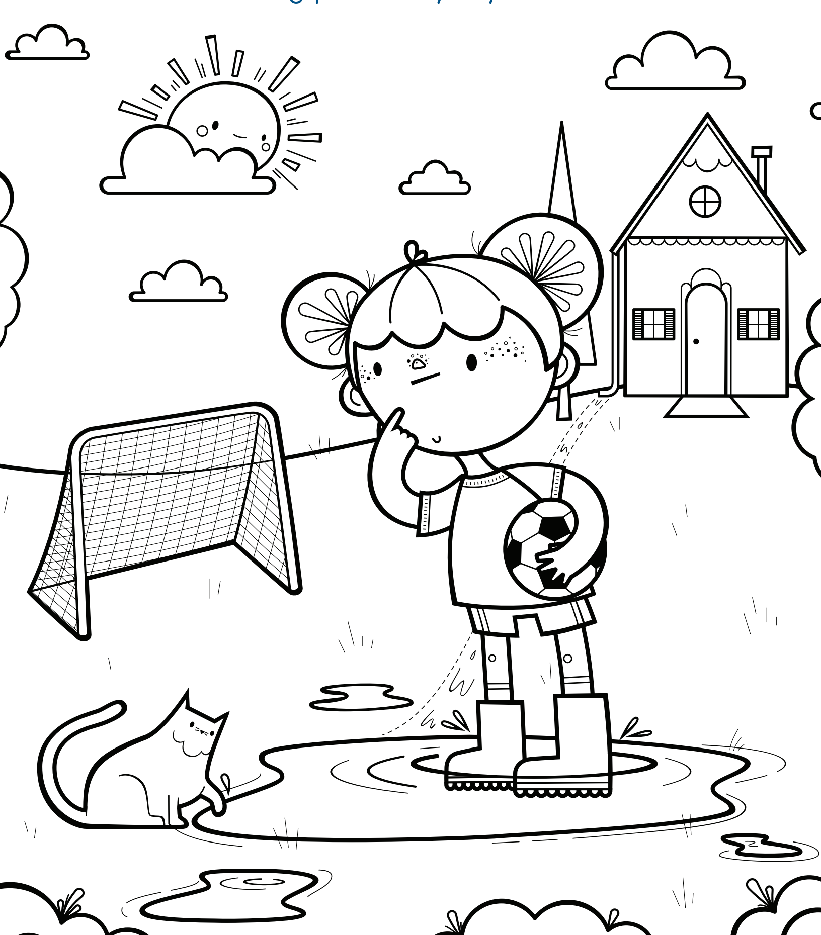
Oh no! It rained and now my yard is wet. I see a big puddle by my soccer net.