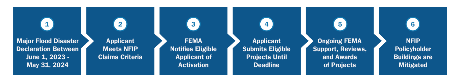
Figure 1: Swift Current Process Overview

Funds will be made available to states, territories, and federally recognized tribal governments that receive a major disaster declaration following a flood-related disaster event and meet all other eligibility criteria. Swift Current is not available to all property owners and aims to provide flood mitigation funding for buildings with a current contract for flood insurance under the National Flood Insurance Program (NFIP) and a history of repetitive or substantial damage from flooding. The total funding available for Fiscal Year 2023 is $300 million, which was made possible through an infusion of dollars by the Infrastructure Investment and Jobs Act (IIJA), better known as Bipartisan Infrastructure Law (BIL). The figure below provides an illustrative overview of the key steps in the Swift Current process.