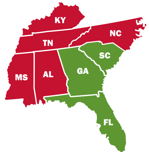
Figure 1. FEMA Region 4