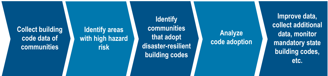
Figure 2. Building Code Adoption Tracking Process

The following percentages indicate the tracked jurisdictions which have adopted hazard-resistant 2 building codes within each state. The percentages are based upon jurisdictions within each state which are at high risk 3 to one or more hazard types (Region 4’s hazards are flood, damaging wind, hurricane wind, tornado, and seismic):