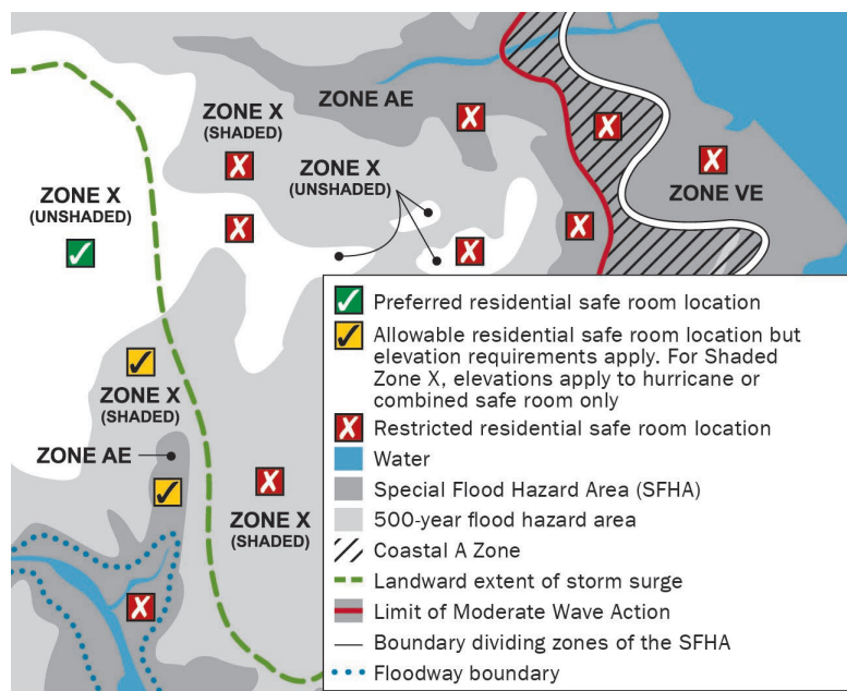
Figure 1: Example illustration of preferred, allowable, and restricted residential safe room locations

Figure 1 shows examples of preferred, allowable, and restricted residential safe room locations relative to the landward extent of storm surge inundation and mapped flood hazards as reflected on a typical Flood Insurance Rate Map (FIRM). Figure 2 illustrates a typical riverine cross section and perpendicular shoreline transect, including the stillwater and wave crest elevations associated with the various flood zones shown in Figure 1.