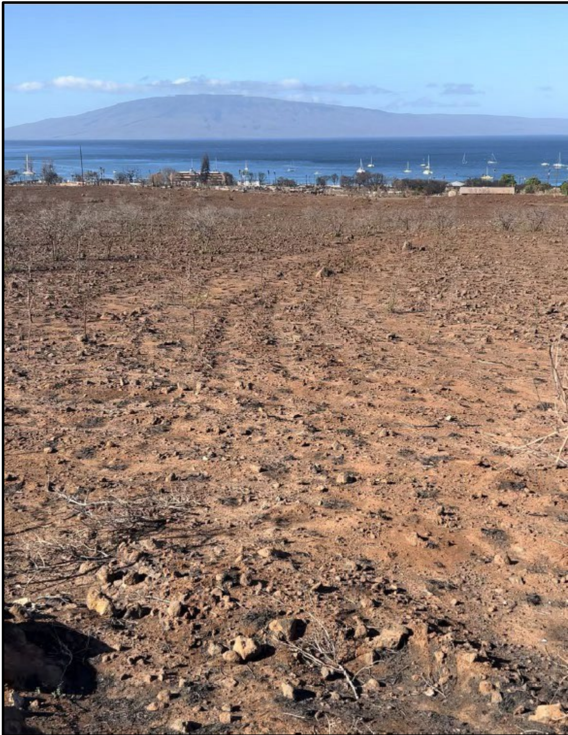
Figure 4 – Facing south from the east/center of the Fleming Road location, facing west, December 2023.