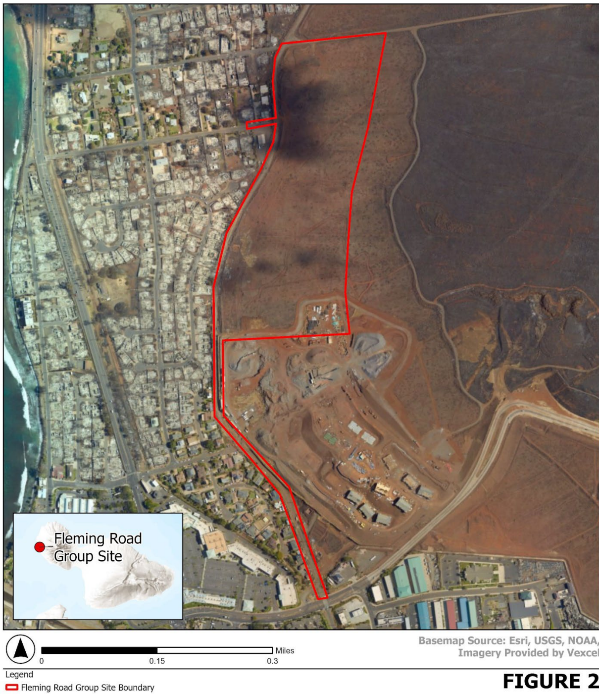
FIGURE 2 Project Area

Fleming Road Temporary Group Site DR-4724-HI Maui County, Hawaii