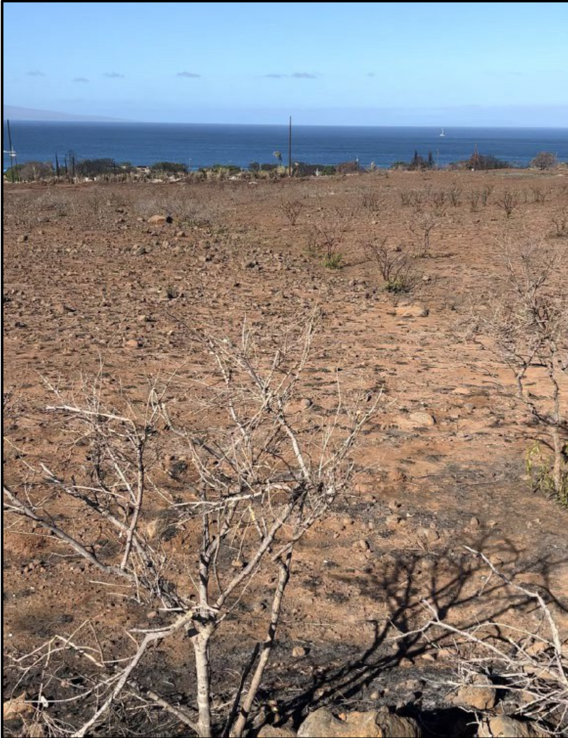
Figure 3 – Facing south from the east/center of the Fleming Road location, facing west, December 2023.