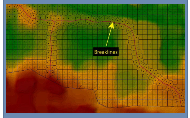
2D analysis models use a gridded surface and a series of breaklines to define the analysis areas.

1D analysis models several cross-sections along a stream reach; these cross-sections are analyzed to determine a water surface elevation.