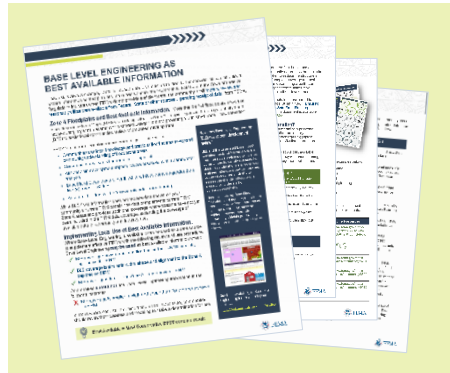
Download BLE as Available Flood Hazard Information from the FEMA website,