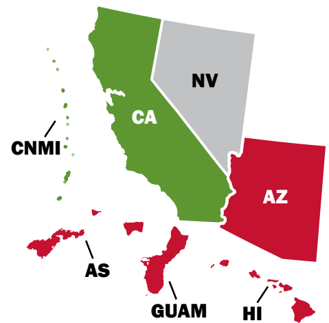
Figure 1. FEMA Region 9