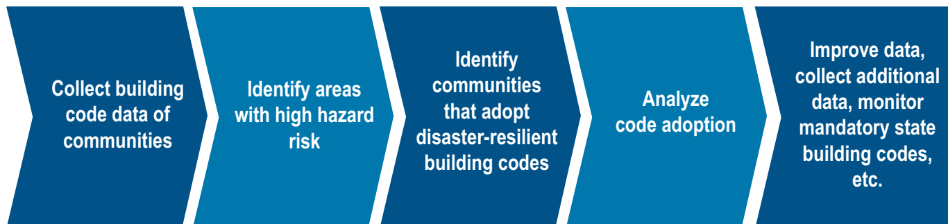
Figure 2. Building Code Adoption Tracking Process

The following percentages indicate the tracked jurisdictions which have adopted hazard-resistant 2 building codes within each state. The percentages are based upon jurisdictions within each state which are at high risk 3 to one or more hazard types (Region 8’s hazards are flood, damaging wind, tornado, and seismic):