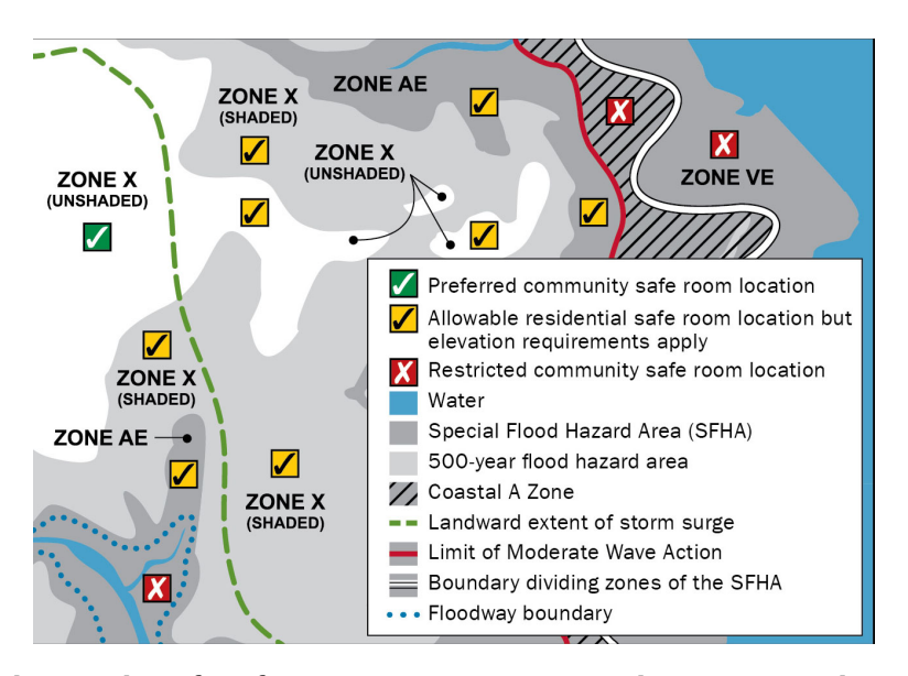
Figure 1: Example illustration of preferred, allowable, and restricted community safe room locations

Figure 1 shows examples of preferred, allowable, and restricted community safe rooms locations relative to the landward extent of storm surge inundation and mapped flood hazards as reflected on a typical Flood Insurance Rate Map (FIRM). Figure 2 illustrates a typical riverine cross section and perpendicular shoreline transect including the stillwater and wave crest elevations associated with the flood zones shown in Figure 1.