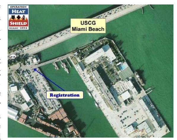
Figure 12. Operation Heat Shield U.S. Coast Guard Miami Beach Station

and several other facilities. Miami designed the event to include 10 round-robin scenarios, with approximately 1,100 exercise participants. Miami conducted Operation Heat Shield II<sup>23</sup>—a seven-scenario round-robin exercise—in May 2018. Miami focused on exercising capabilities not addressed in the first Operation Heat Shield, inviting even more stakeholders to participate in the exercise. The training included scenarios that tested response capabilities for active shooters, mass casualty situations, crowd control, and forensics. More than 200 on-duty deputies and EMS personnel were trained in techniques for rapidly moving wounded individuals away from cleared areas and preparing them for treatment and transport.<sup>24</sup>