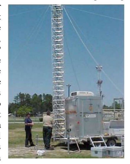
Figure 2. MARC Unit

the use of deployable communications systems to further facilitate the lifesaving response and recovery efforts of first responders. Florida invested several deployable in communications systems in recent years. In FY 2015 and 2016, Florida used $282,402 and $80,000, respectively, in SHSP funding to invest in emergency deployable interoperable communications systems (EDICS) and Emergency Deployable Wide Area Remote Data Systems (EDWARDS). EDICS are located throughout the state and are used to bridge different types of radio systems together and allow public safety officials to communicate directly. The EDWARDS is a data package that accompanies EDICS. Additionally, in FY 2015-2017, Florida used $3,935,048 in SHSP funding to sustain and replace Mutual Aid Radio Communications (MARC) systems. MARC systems are self-sustaining units strategically placed throughout Florida that provide a distribution mechanism for portable radios that are commonly programmed to allow first responders to have