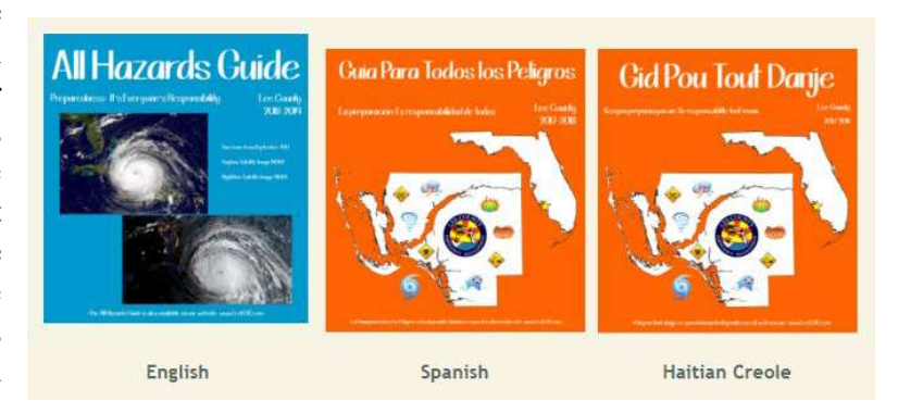
Figure 6. All Hazards Guides

community—including those members of the community with access and functional needs. For example, Lee County has published the All Hazards Guide for more than 20 years, but updated it this year after the unprecedented 2017 hurricane season. The All Hazards Guide is printed in English, Spanish, and Haitian Creole. The guide is intended to help the community