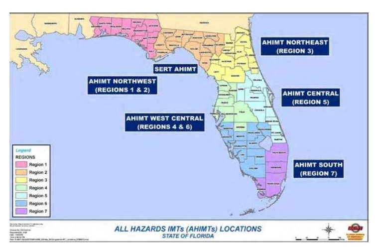
Figure 3. AHIMT Locations

Between FY 2016 and 2017, Florida used approximately $803,057 in SHSP funding to support AHIMTs. Florida has six AHIMTs: five are county teams and one is a state team located in Tallahassee. AHIMTs report to the Operations Section Chief, unless otherwise determined by the State Emergency Response Team (SERT) Chief or the State Coordinating Officer (SCO), and liaise between SERT and the SCO during an incident. AHIMTs provide situational awareness and support for operational planning to the SERT and the SCO by incorporating