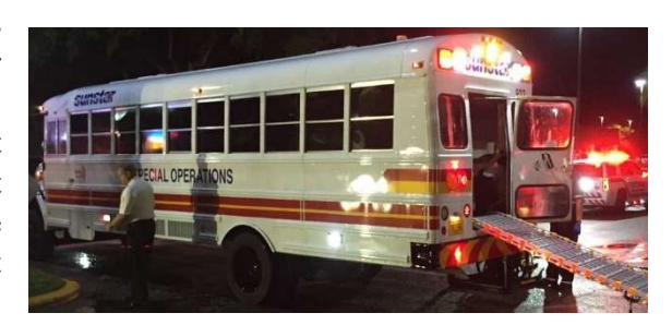
Figure 7. Mass Casualty Ambulance-Bus

Collier County began considering the potential uses and benefits of obtaining an ambulance bus after reviewing the Hurricane Katrina after-action report, which indicated that the use of a multi-patient ambulance bus could have played an important role. One real-world event that initiated the request for the vehicle was a mass casualty accident on Interstate 75 in which 10 people died and 21 patients (including six trauma patients) needed hospital care. In FY 2013, Collier County used