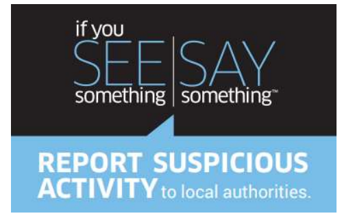
Figure 11. Florida's "If You See Something, Say Something" Poster

before crime occurs. Florida's "If You See Something, Say Something" campaign provides citizens with an outlet to report suspicious activity. Florida initially launched the campaign in 2011; FDLE relaunched the campaign in November 2015 after the Paris terrorist attacks. DSOC made this a funding priority in 2016. FDLE provided educational materials to the public and business community, and unveiled an online toolkit containing educational videos and flyers. The campaign is currently seeking $200,000 of SHSP funding in FY 2019 to create and disseminate marketing materials, including outdoor