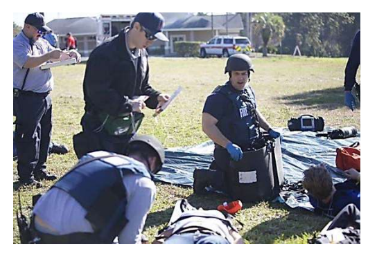
Figure 10. Forest Lake Academy Active Shooter Full-Scale Exercise

disgruntled student who opened fire in a school, causing multiple casualties, panic, and chaos, at Forest Lake Academy in Apopka, Florida. Over 20 agencies participated in the exercise and more than 115 community members volunteered to serve as exercise actors. Participating agencies included local law enforcement and fire departments, the Seminole County Office of Emergency Management, and the Seminole County Communications Center. After the immediate exercise response, exercise players tested their ability to establish and manage an FRC where they reunified students with their parents. With the FRC component, the exercise was one of the largest and most complex exercises conducted in Seminole County.<sup>21</sup>