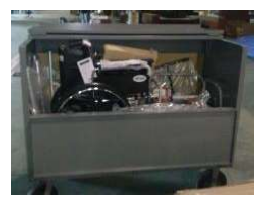
Figure 9. Shelter Supplies and Functional Needs Equipment

From FY 2005 through FY 2018, Seminole County used approximately $10,000 in EMPG funding each year to purchase and replenish sheltering equipment. Since FY 2014, Seminole County has used $2,000 annually to train shelter workers. Seminole County must train all county staff to work in shelters because the American Red Cross no longer provides shelter assistance during hurricanes. In FY 2012, Seminole County used $15,000 in SHSP funding to build a cache of medical equipment for use during a mass casualty event. In FY 2018, Seminole County used $16,800 in EMPG to rent a shelter warehouse to store shelter equipment, the medical equipment cache, and other sheltering commodities.