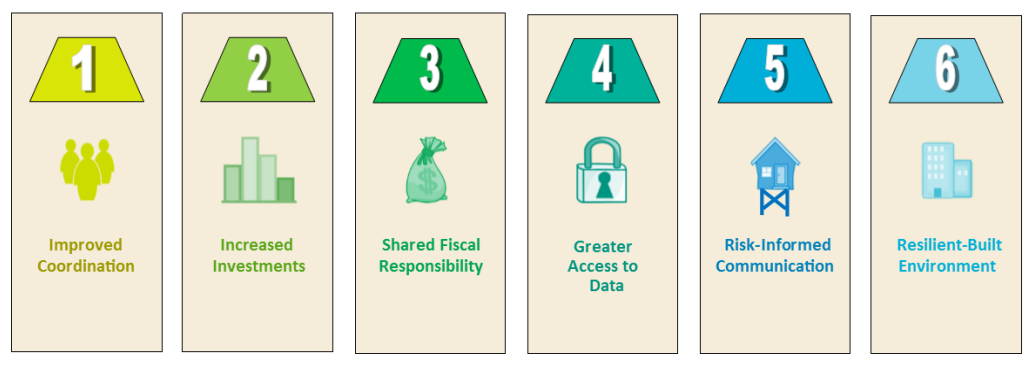
Figure 2. Draft Strategy Outcomes

Recommendations Criteria. All 22 recommendations satisfied the following criteria: