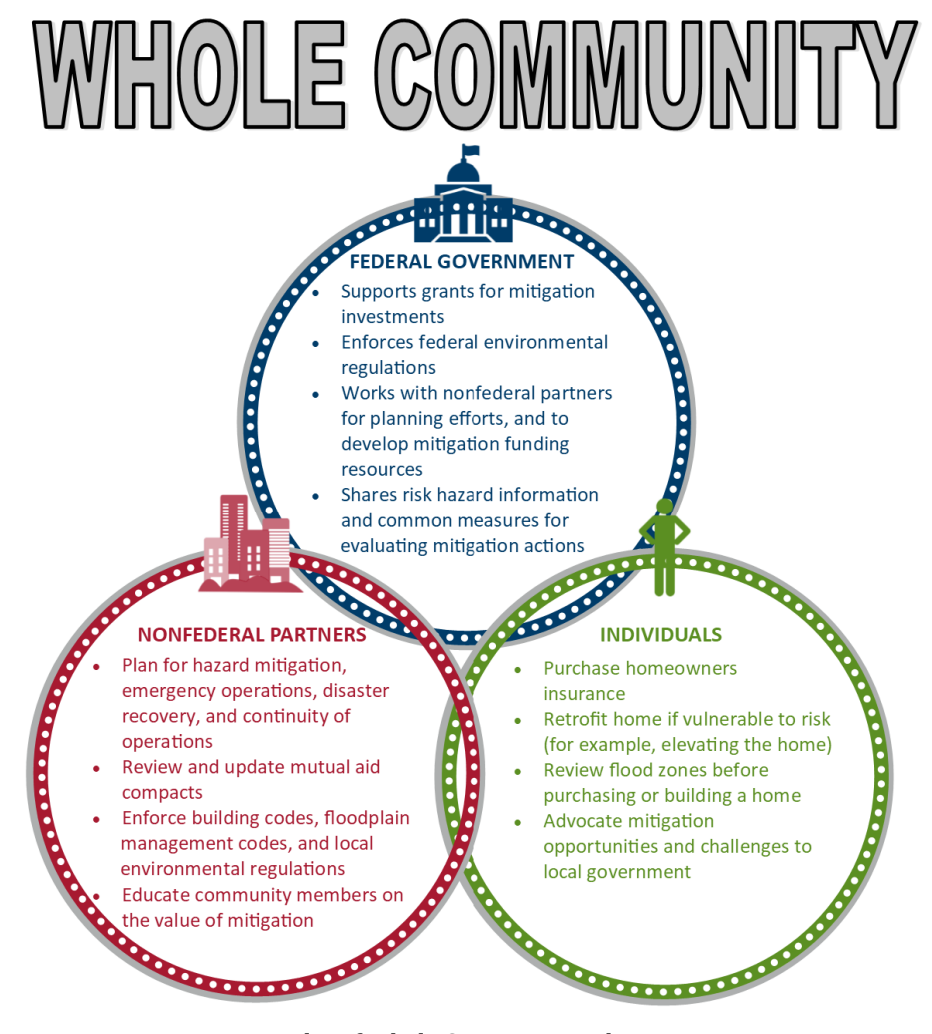
Figure 1. Examples of Whole Community Roles in Mitigation

The Investment Strategy responds to a recommendation by the U.S. Government Accountability Office (GAO). In 2015, the GAO reviewed the federal response to Hurricane Sandy. Within its key findings, the GAO found that mitigation investments had not been coordinated, even within the Federal Government. This lack of coordination reduced the effectiveness of investments.