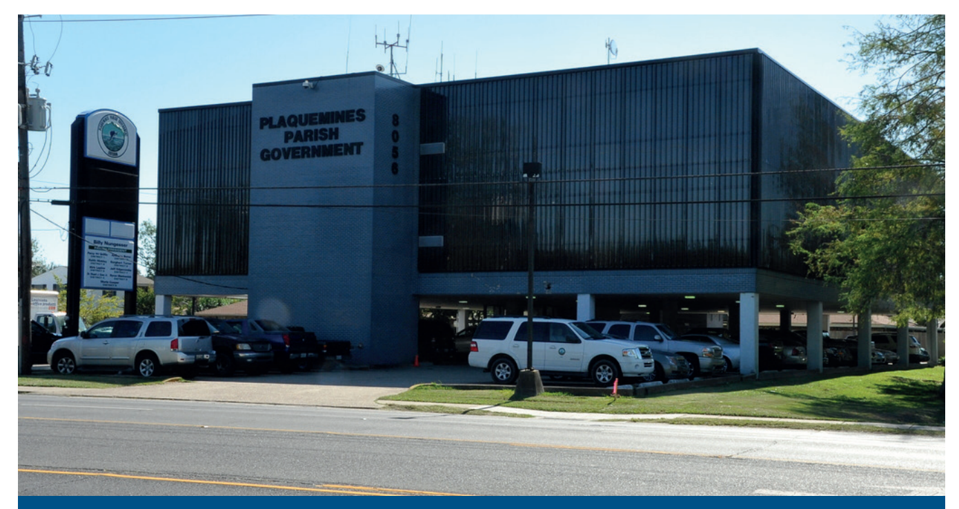
State asset inventories should include information on whether the assets have been mitigated or built to withstand hazard events. In this example, the Plaquemines Parish Government Building was constructed on pilings and includes storm panels that withheld winds up to 120 miles per hour.

systems, buses, ports, ferries, airports, potable water, wastewater, oil, natural gas, electric power, and communication systems. For more information on the Hazus-MH databases, visit the <u>Summary of Databases in Hazus-Multi Hazard</u>.