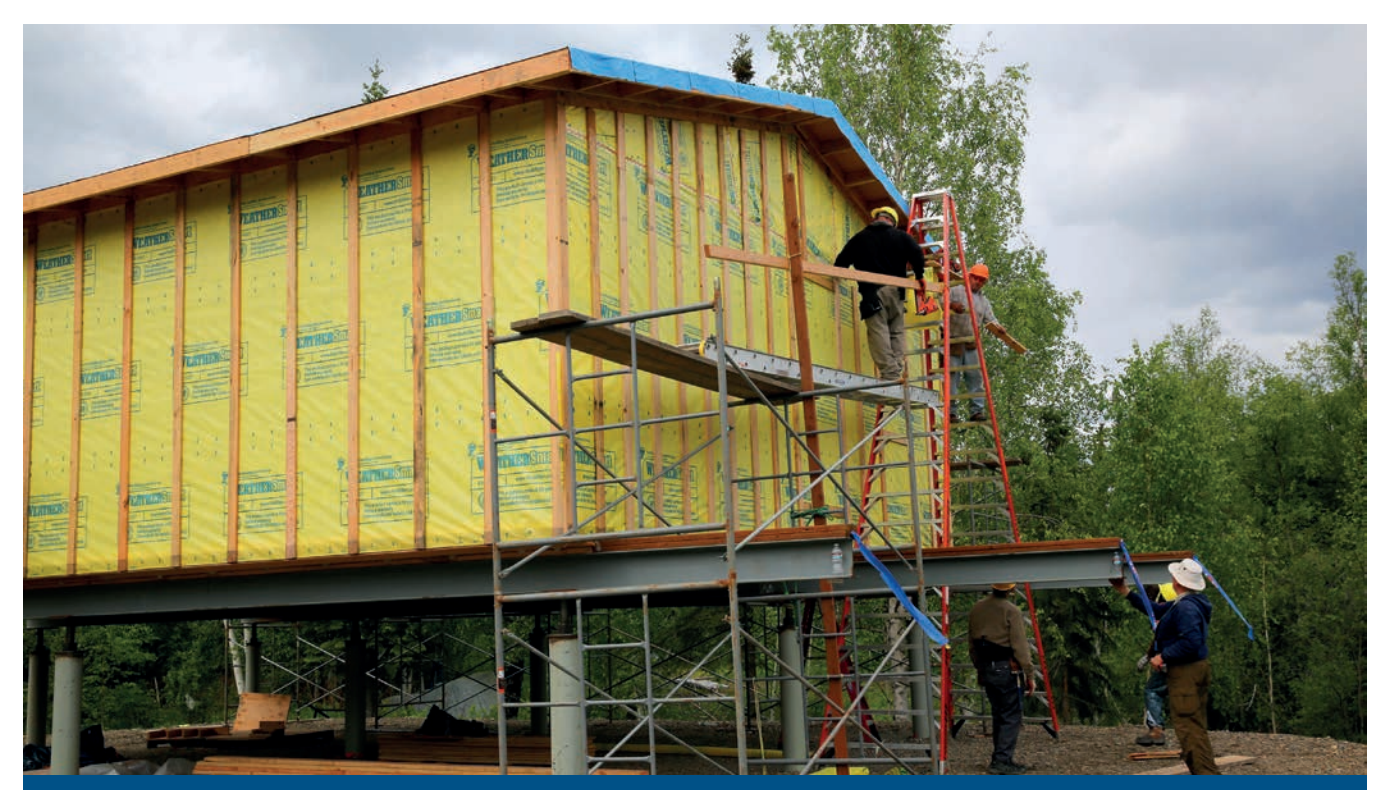
Volunteers from Samaritans Purse and United Methodist Volunteers work together to build a Cold Climate Home for a disaster Survivor in Galena, Alaska.

States must include an overview and analysis of the vulnerability of jurisdictions to the identified hazards and the potential losses to vulnerable structures at the local level. This means that state plans must identify, as applicable, the local and tribal jurisdictions that are most vulnerable to each of the identified hazards. This includes identifying the jurisdictions most at risk to each hazard as determined by the state's risk analysis, as well as summarizing the findings of the risk assessments from the jurisdictional plans. The inclusion of local findings in the state's assessment ensures that all structural and population impacts identified by locally maintained data are considered. This summarization will help states compare the impact and losses across the state from each hazard, and across all hazards, to better prioritize mitigation actions in the areas subject to hazards that cause the most losses. This local plan roll-up can be a challenge, as local hazard mitigation plans vary in structure, analysis methods, and identified hazards. To make capturing local information more manageable, states should consider capturing local vulnerability and loss information during the state's review of local hazard mitigation plans. Encouraging local officials to use the state's risk assessment data and analysis methodology will also make local plan roll-up smoother, because all plans will use a common basis of information for the risk assessment.