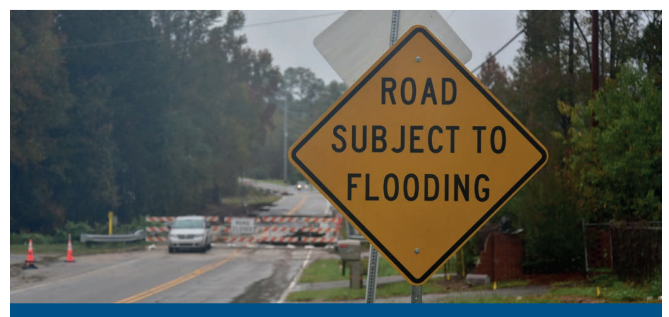
Many roads, such as this one in South Carolina, have hazard warning signs.

Part of reviewing the information in the previous plan will include a validation of the state-owned or operated buildings, infrastructure, and critical facilities. States must determine if these assets are operational, if there has been a change in the function of an asset, or if additional assets have been built or identified as critical. Additionally, states should validate the locational and value assessment data in the previous plan to ensure it is accurate and up-to-date for the risk analysis.