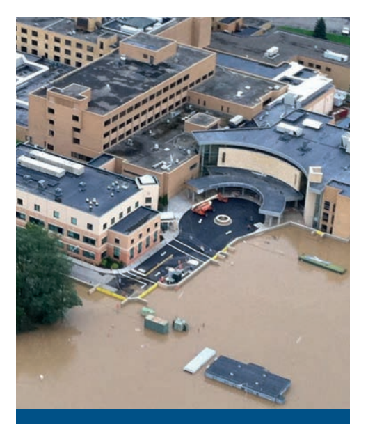
Floodwall Protected this vital property from flood waters that devastated other parts of the city, even as rising water from the Susquehanna River engulfed the parking lot of Binghampton, NY s Our Lady of Lourdes hospital during Tropical Storm Lee.

If state-level, recent data are not available, states can turn to the inventories and databases included in FEMA's Hazus-Multi-Hazard (Hazus-MH) program as a possible data source. Hazus MH inventories contain a number of useful data points, including hospitals, police stations, fire stations, schools, emergency operations centers, dams, nuclear power plants, highway systems, railway systems, light rail