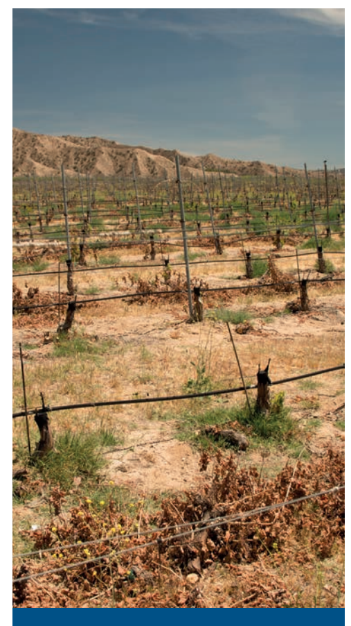
California drought in the Cuyama Valley.

The exact method of incorporating future conditions information will vary by hazard type. The analyses and available data that can be used to inform a state's risk assessment is growing on an annual basis. While in their current update a state may be able to identify mostly qualitative data to inform their findings of future probability, they can gather valid quantitative data before the next update to improve the assessment of future conditions on a state's risk.