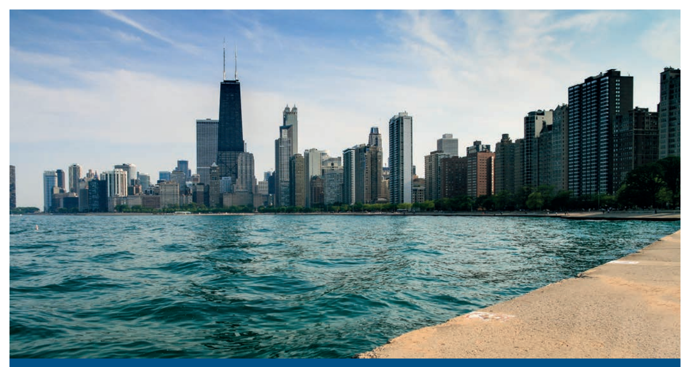
In order to reduce risk for the economy and population the state needs a comprehensive understanding of the risks and vulnerabilities they face. USA, Illinois, Chicago skyline from Lincoln park.