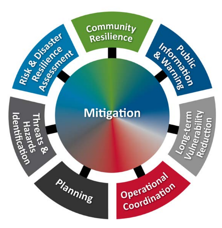
Figure 4: Mitigation Core Capabilities

There are three capabilities that cross all five mission areas: Planning, Public Information and Warning, and Operational Coordination. These capabilities are shared and provide direct linkages among the mission areas.