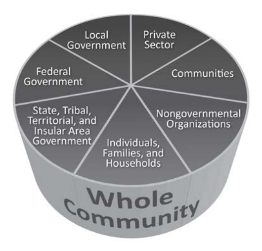
Figure 2: Composition of the Whole Community

capabilities—making these investments an increasingly effective, cost-efficient, and sustainable approach for the whole community to build resilience.