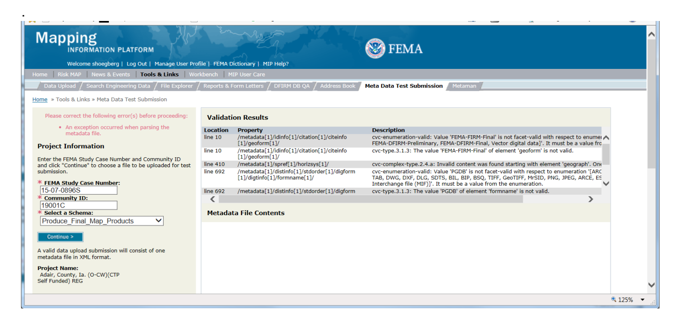
Figure 2: MetaMan Interface

MetaMan checks the submitted metadata file for conformance to FGDC metadata standards. It also includes checks for specific FEMA metadata requirements. These checks are specific to the metadata profile used for the metadata file being submitted. MetaMan does not include any checks for consistency between the submitted spatial data and the metadata. Those consistency checks are performed by DVT.