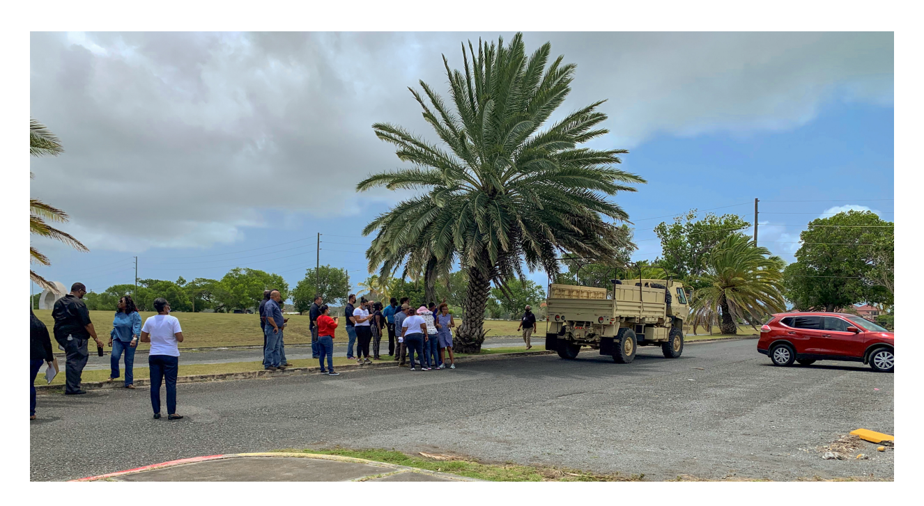
St. Croix, U.S. Virgin Islands, July 13, 2021 – Members of Region 2's Incident Management Assistance Team, FEMA Virgin Islands logistics staff and territorial partners from the Virgin Islands Territorial Emergency Management Agency and U.S. Virgin Islands Department of Human Services conduct a Community Points of Distribution field exercise at Educational Complex.