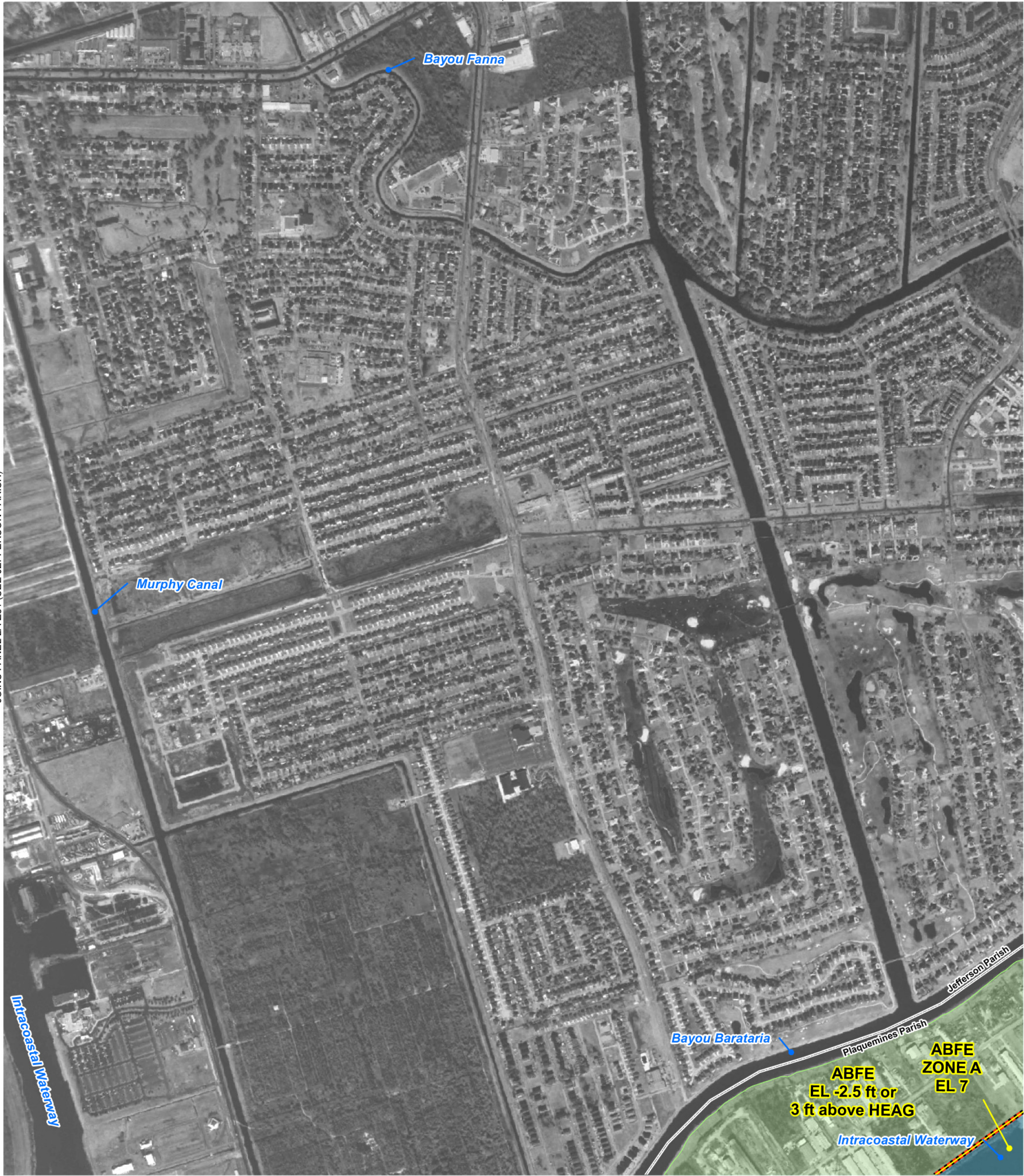
JOINS PANEL LA-Y32

JOINS PANEL LA-Z31 (SEE JEFFERSON PARISH)