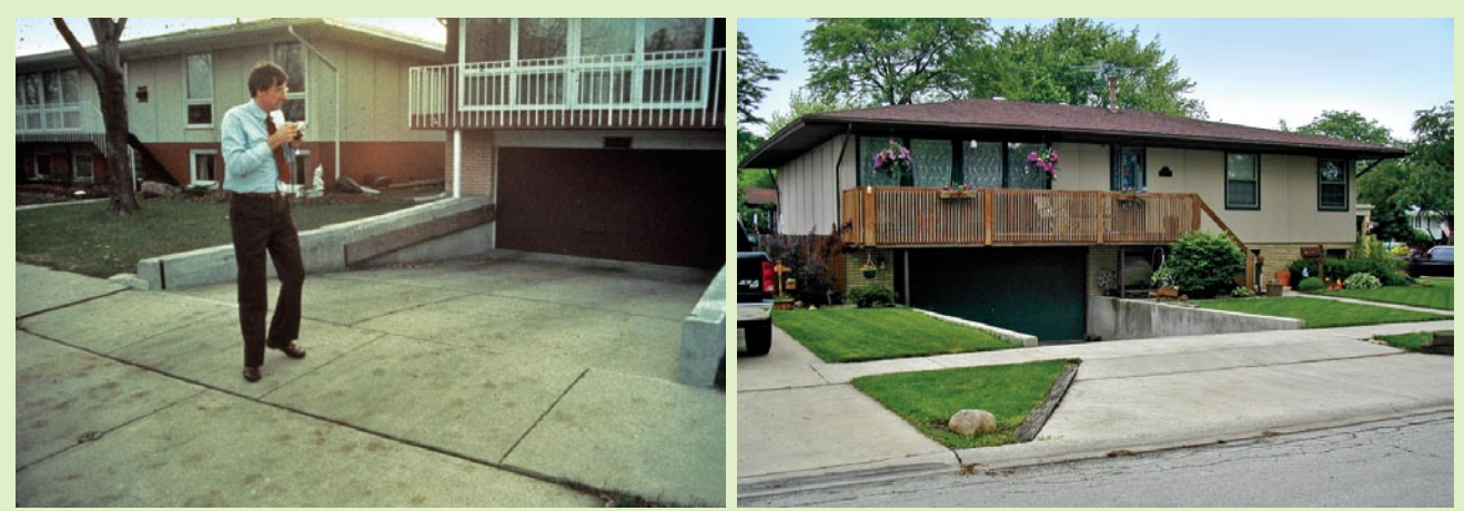
French & Associates