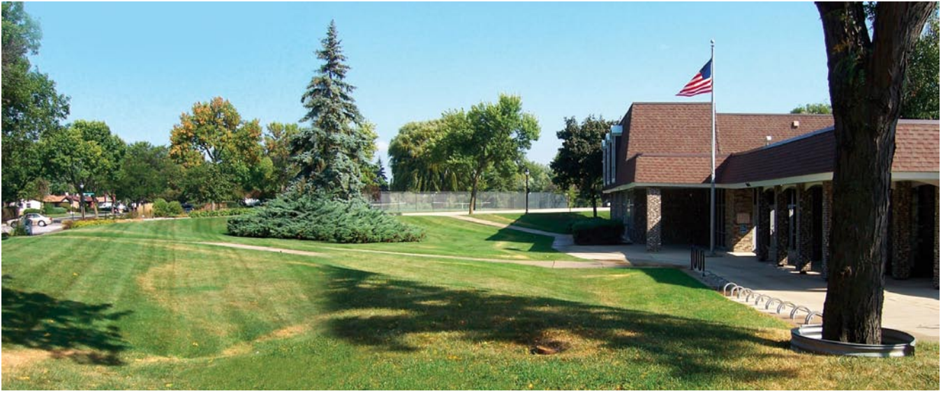
French & Associates

This library was built on flood-prone land donated by a developer. After flooding in 1986, 1987, 1989, and 1990, the library was relocated. The building was given to the fire department for a headquarters and training facility, and the village built this levee. The levee surrounds the building and has no openings requiring human intervention. The top is 2 feet above the 100-year flood.