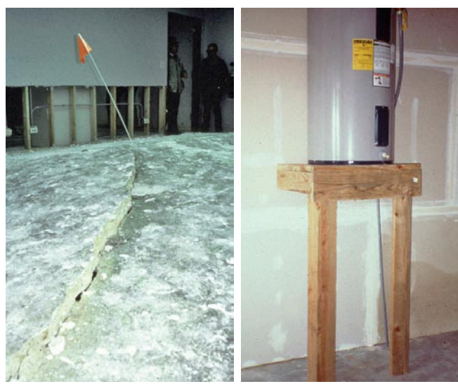
French & Associates

Wet floodproofing is a term that covers various ways to protect a structure, its utilities, and its contents, while allowing flood waters to enter the structure. Wet floodproofing is the complement of dry floodproofing—the latter keeps water out, but at risk of