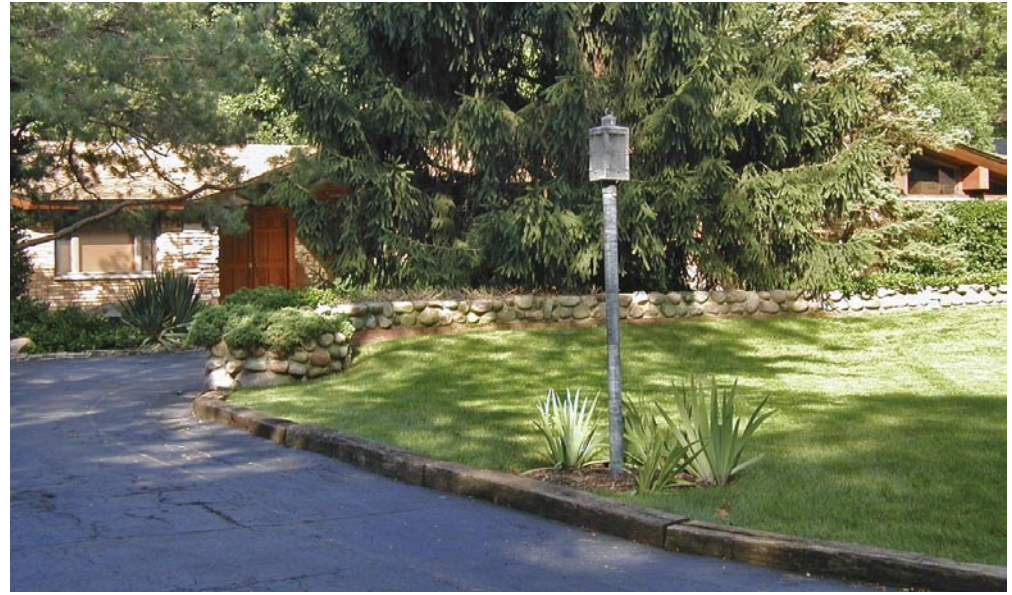
French & Associates