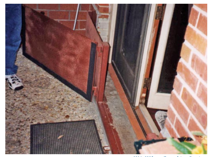
W.A. Wilson Consulting Services

This house on a slab was dry floodproofed. The first 1.5 feet of the brick walls were covered with plastic sheeting, which was covered with facing brick to protect it from debris impact and damage by sunlight. A steel gate with rubber gaskets provides access at the doorway.