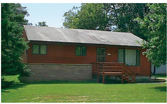
French & Associates

If a building is to remain in place, elevating it to prevent flood waters from reaching vulnerable areas is considered the most effective retrofitting technique. The structure typically is raised so that the lowest floor is at or above the design flood elevation (DFE).