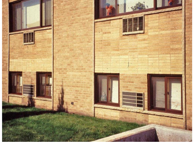
French & Associates

This house on a slab was dry floodproofed. The first 1.5 feet of the brick walls were covered with plastic sheeting, which was covered with facing brick to protect it from debris impact and damage by sunlight. A steel gate with rubber gaskets provides access at the doorway.