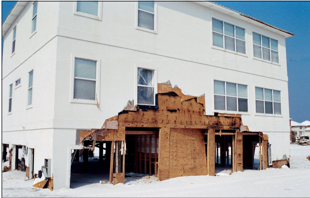
Figure 4. Building siding extended down and over the breakaway wall. Lack of a clean separation allowed damage to spread upward as the breakaway wall failed.