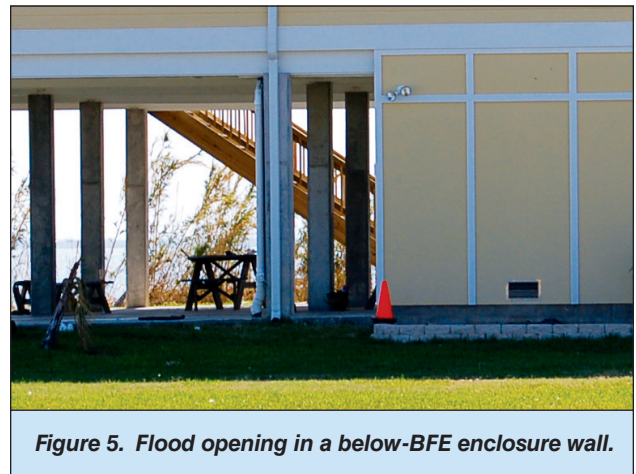
Figure 5. Flood opening in a below-BFE enclosure wall.

Details concerning flood openings can be found in FEMA (2008c) Technical Bulletin 1-08, Openings in Foundation Walls and Walls of Enclosures .