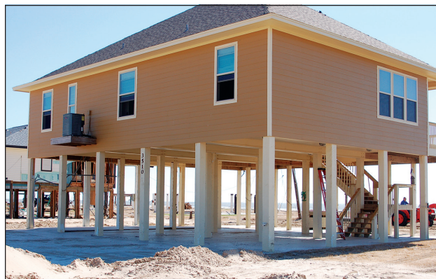
Figure 2. Breakaway walls beneath this building failed as intended under the flood forces of Hurricane Ike.

Breakaway walls must be designed to break free under the larger of the following Allowable Stress Design loads: 1) the design wind load, 2) the design seismic load, or 3) 10 pounds per square foot (psf), acting perpendicular to the plane of the wall (see Figure 3 for an example of a compliant breakaway wall). If the Allowable Stress Design loading exceeds 20 psf for the designed breakaway wall, the breakaway wall design must be certified . When certification is required, a registered engineer or architect must certify that the walls will collapse under a water load associated with the base flood and that the elevated portion of the building and its foundation will not be subject to collapse, displacement, or lateral movement under simultaneous wind and water loads. Breakaway walls must break away cleanly and must not damage the