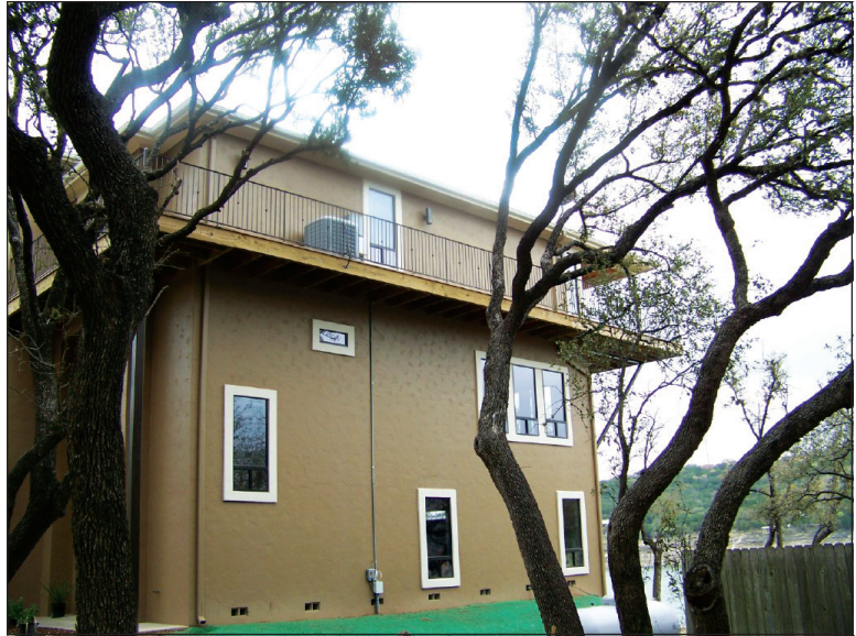
Figure 7. Example of a two-story enclosure below the BFE. This type of enclosure presents special construction and flood insurance issues. Contractors should proceed with caution when an owner requests such an enclosure.

■ Two-story enclosures below elevated buildings (see Figure 7). As some BFEs are established higher and higher above ground, some owners have constructed two-story solid wall enclosures below the elevated building, with the upper enclosure having a floor system approximately midway between the ground and the elevated building. These types of enclosures present unique problems. In A Zones both levels of the enclosure must have flood openings in the walls unless there is some way to relieve water pressure through the floor system between the upper and lower enclosures; in V Zones, the enclosure walls (and possibly enclosure floor systems) must be breakaway; special ingress and egress code requirements may be a factor; these enclosures may result in substantially higher flood insurance premiums.