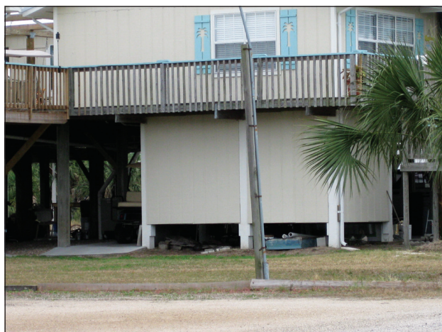
Figure 6. Example of an enclosure that does not extend to grade. This type of enclosure presents special construction and flood insurance issues. Contractors should proceed with caution when an owner requests such an enclosure.