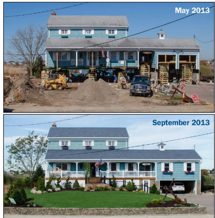
Figure 3: House elevated above BFE after Hurricane Sandy (Freeport, NY)

Freeboard: The vertical difference between the lowest floor of a building and the BFE, usually expressed in feet. It can be thought of as a factor of safety to compensate for the fact that flood levels can reach higher than the BFE.