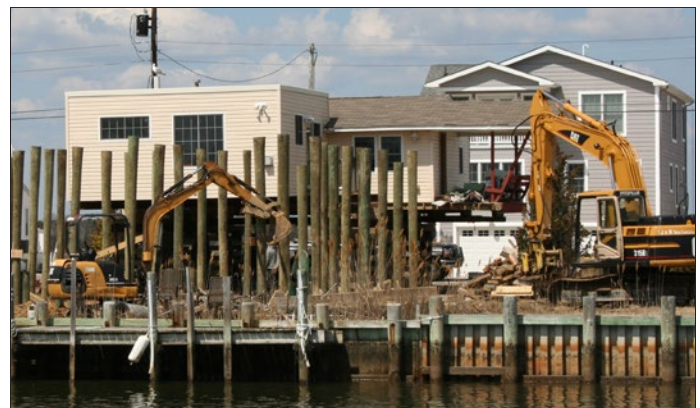
Figure 2: House being elevated on piles in Tuckerton, NJ