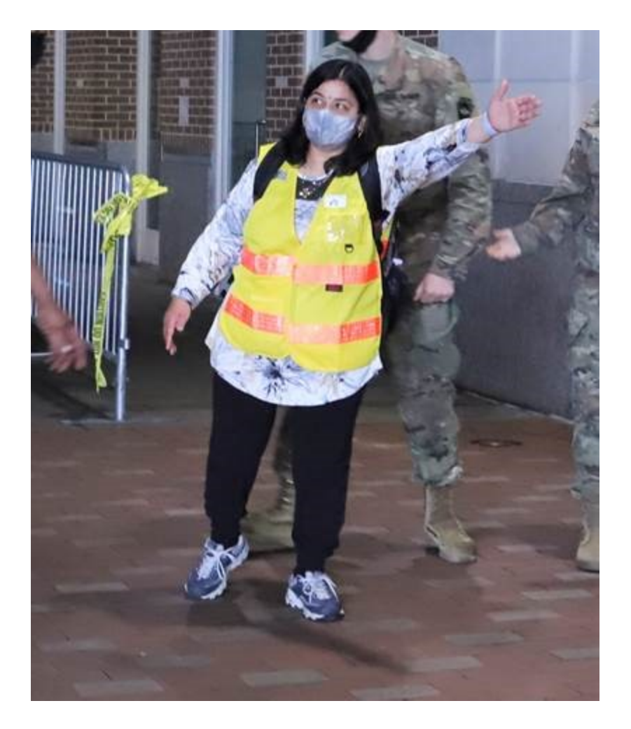
Caption: A Sewa volunteer manages traffic control at the state-run, federally-supported Center City Community Vaccination Center in the Pennsylvania Convention Center in Philadelphia.