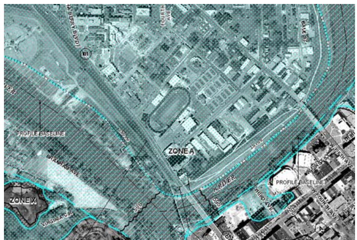
DFIRM with Zone A (Scenarios C, D, and E)