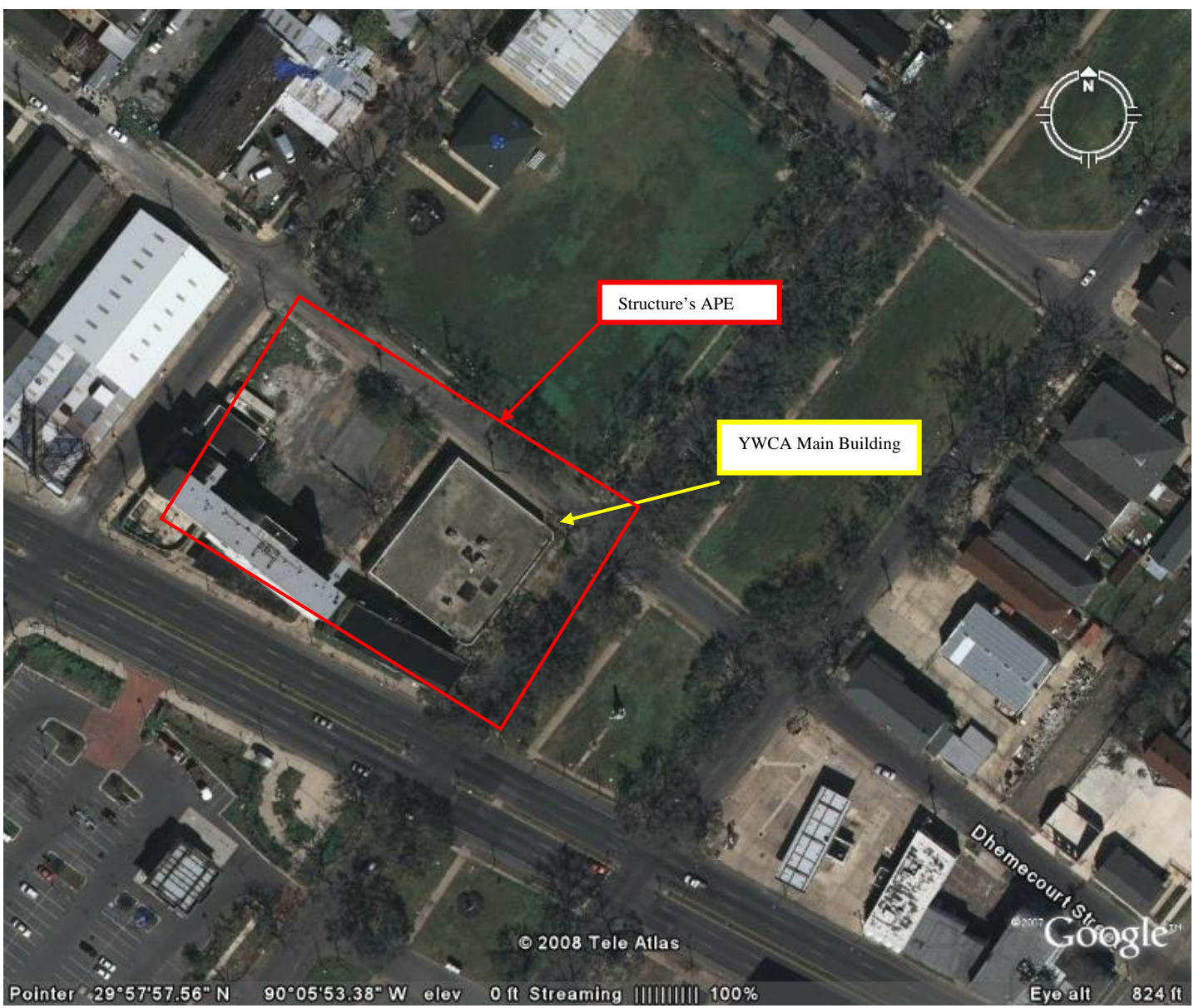
Attachment 1: Aerial photograph of block and historic structures APE

Resource Coordinates: 29.575756 N; -90.055338 W