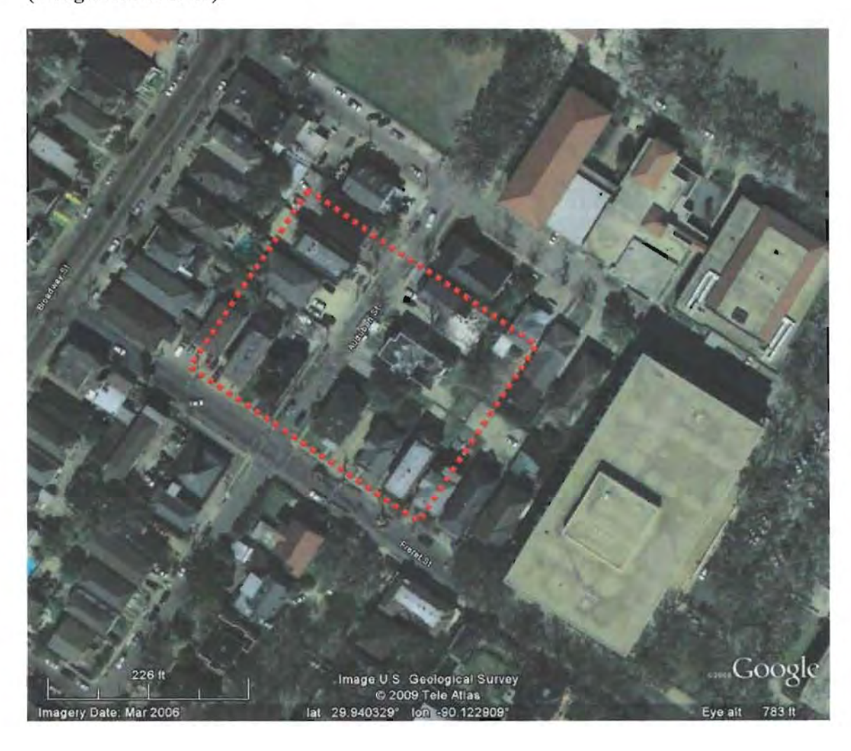
Attachment 1. Aerial View of Study with APE for Standing Structures, Outlined in Red.