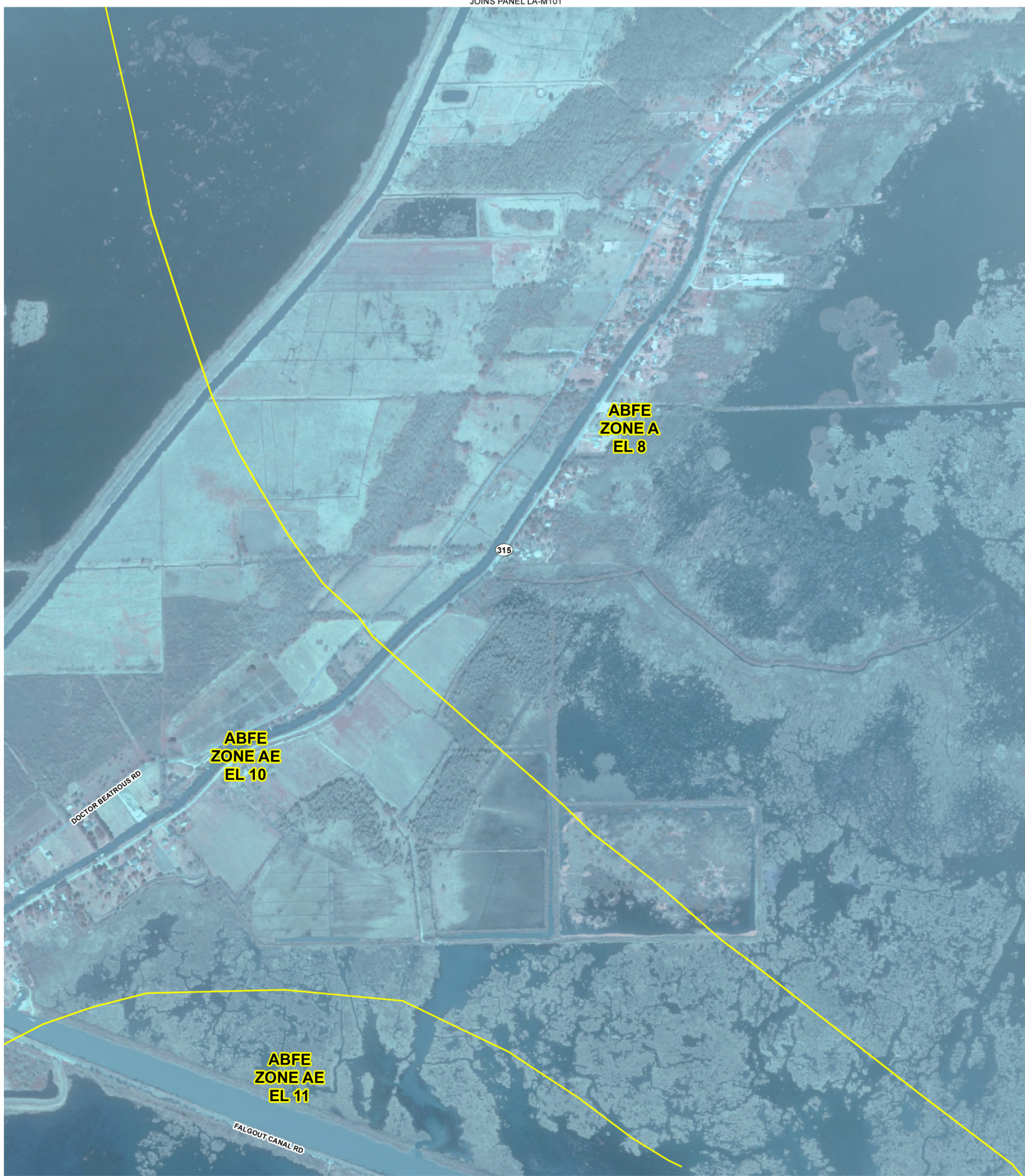
PANEL NOT PRINTED