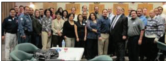
Members of the Ysleta del Sur Pueblo, local, State, and Federal officials gather for a group photo at the Tigua Challenge.

A Texas tribe - the Ysleta del Sur Pueblo in El Paso - has made FEMA Region VI history through an exercise called, The Tigua Challenge. The purpose of the challenge was to exercise Tribal continuity plans, policies, and procedures. Continuity plans are designed to help groups and agencies stay organized and functional in order to continue to help others in all types of situations.