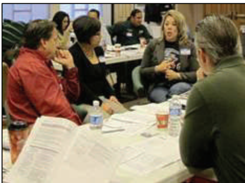
Tribal, local, State and Federal officials participate in the Tigua Challenge in El Paso.